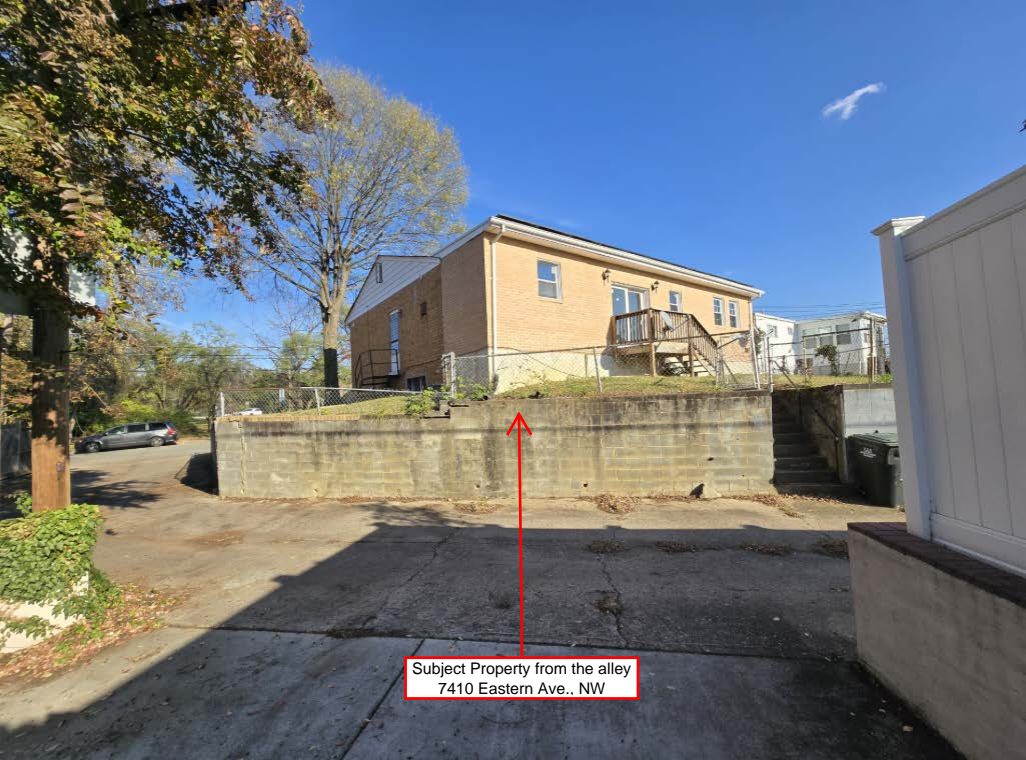
Subject Property from the alley 7410 Eastern Ave., NW