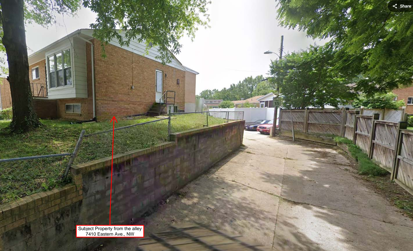
Subject Property from the alley 7410 Eastern Ave., NW