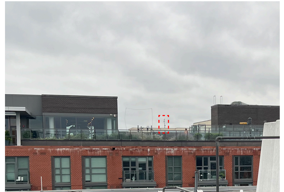
F: 1025 FIRST ST SE