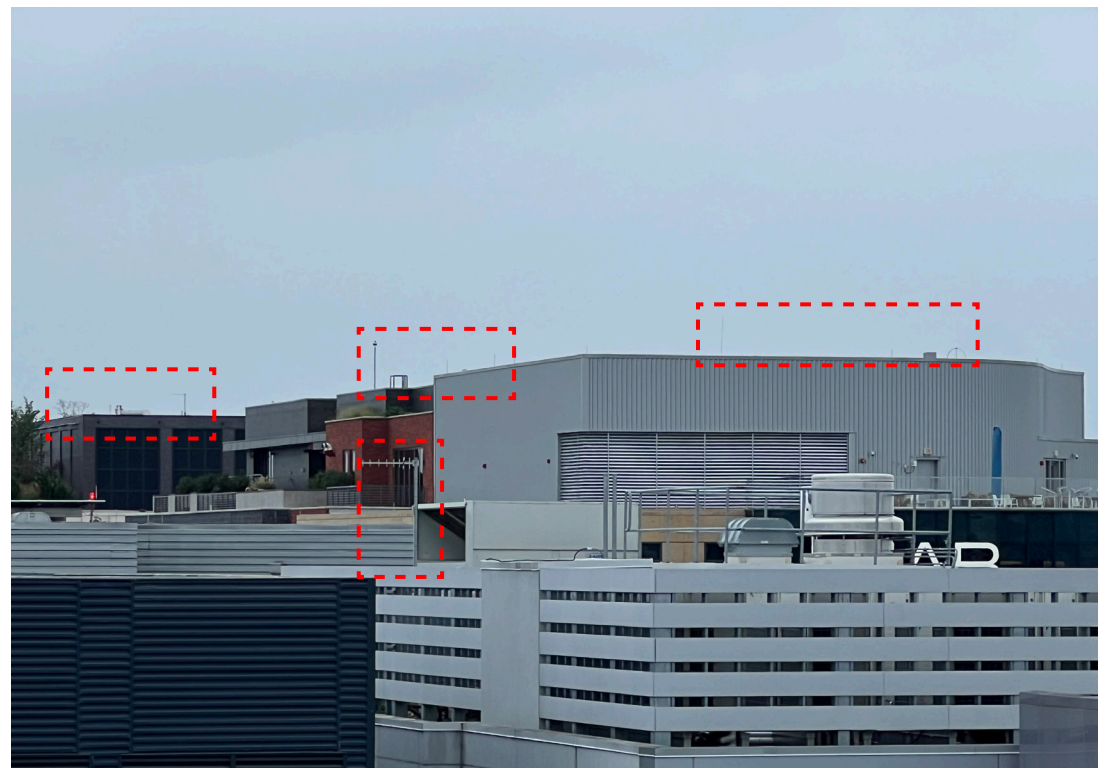
G: 1 M ST SE