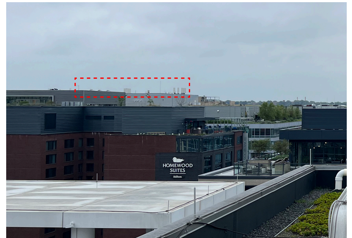
H: 50 M ST SE