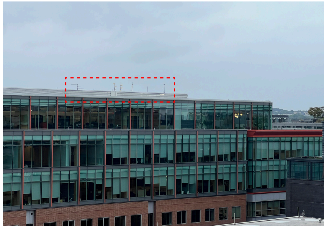
E: 80 M ST SE