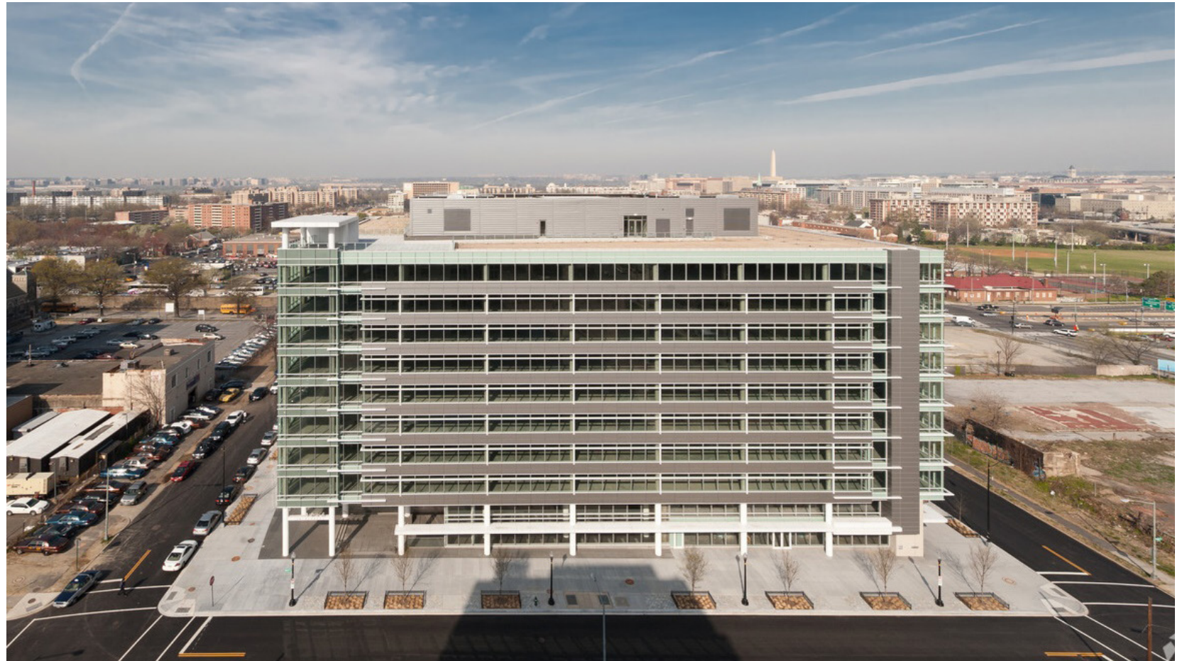
B: EXISTING BUILDING