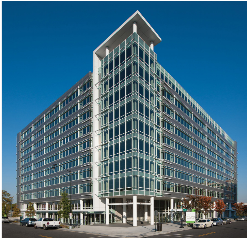
A: EXISTING BUILDING