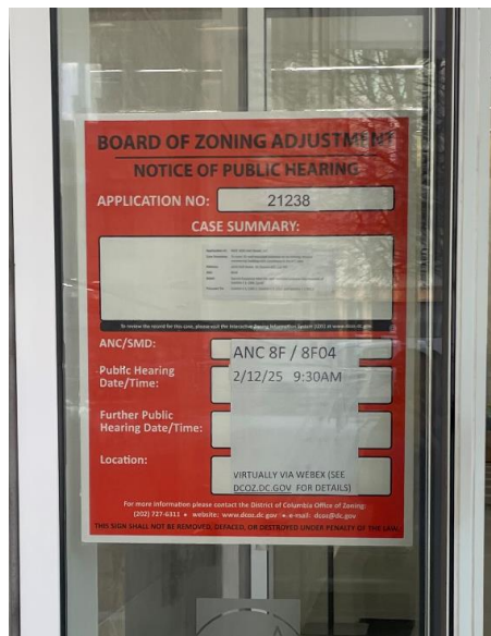
2. 1/27/25 – L Street SE