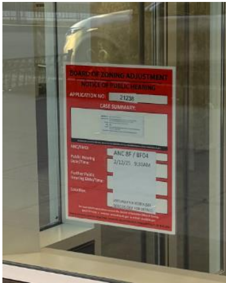
1. 1/27/25 – Half Street SE