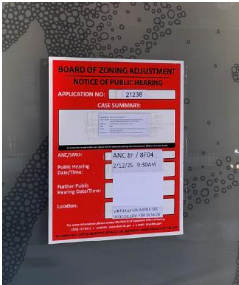
3. 1/27/25 – K Street SE