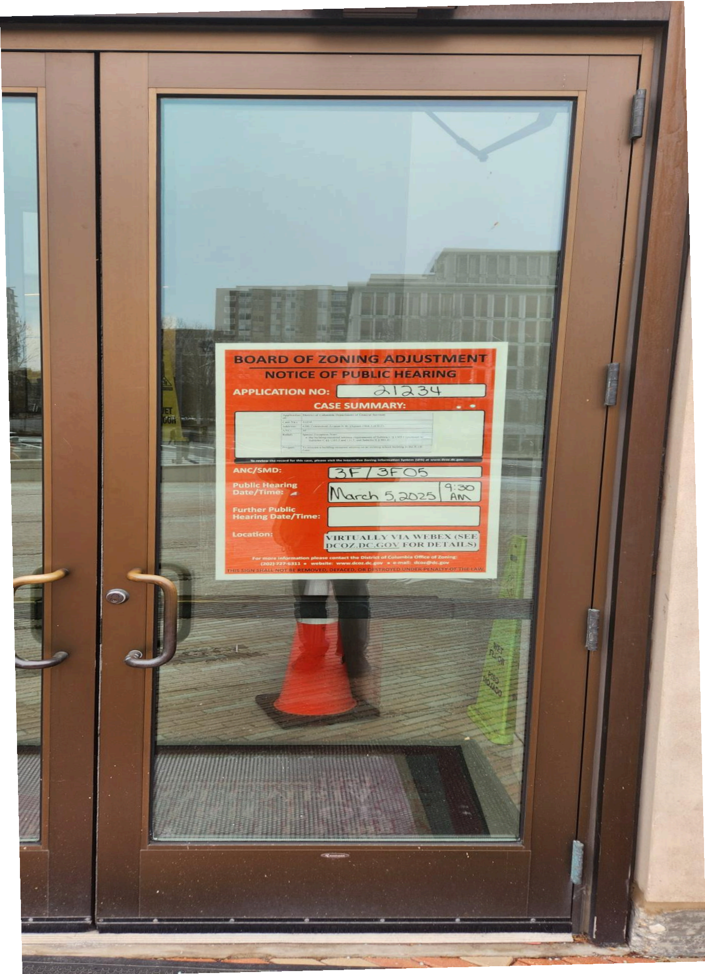
Photograph #2 Close up view of poster from 4200 Connecticut Avenue, NW