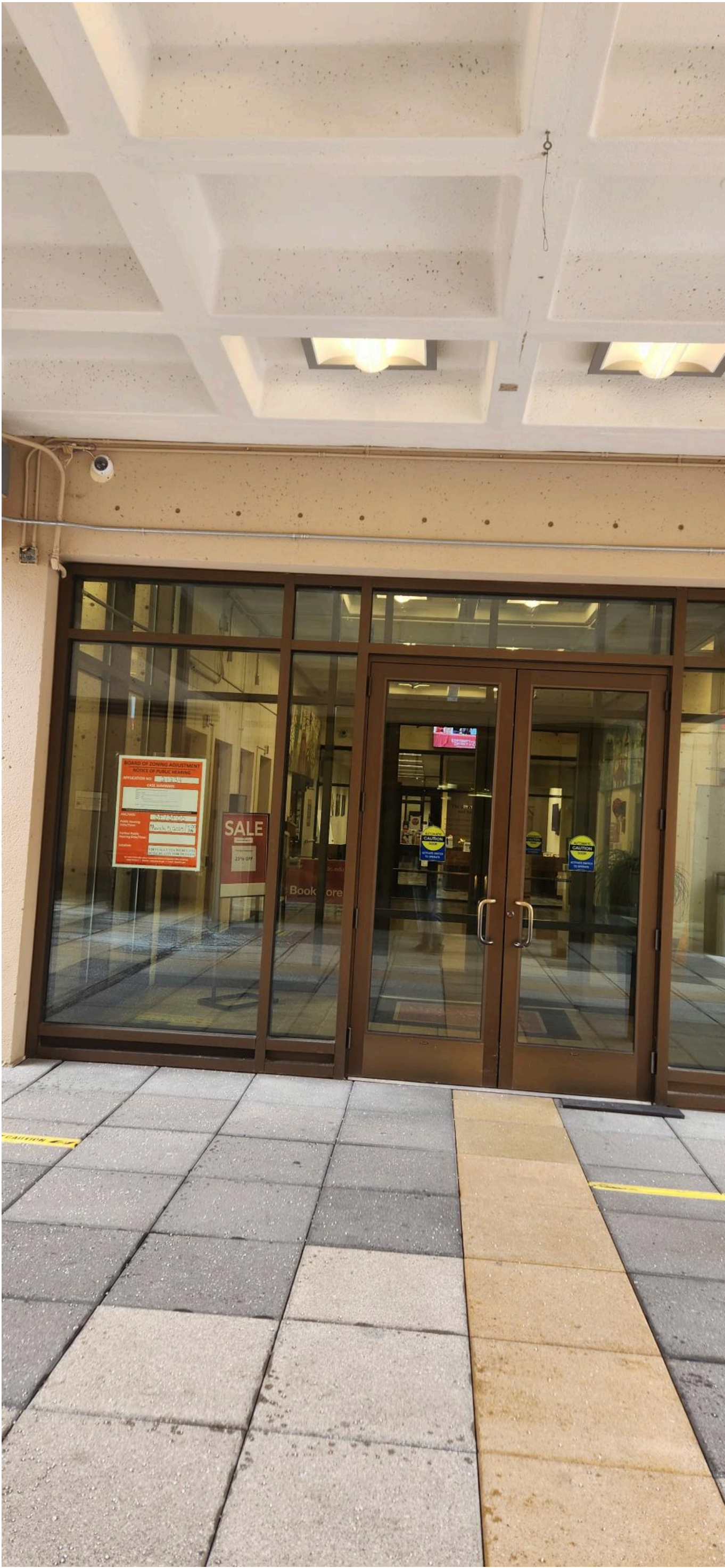
Photograph #3 View from Entrance to Building 38 - Location of Radio Site