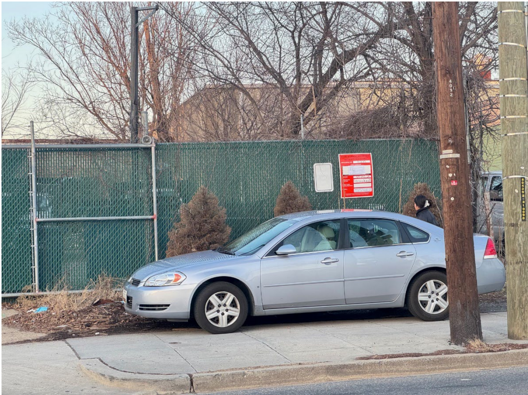
1220 Mount Olivet NE – Photo 4