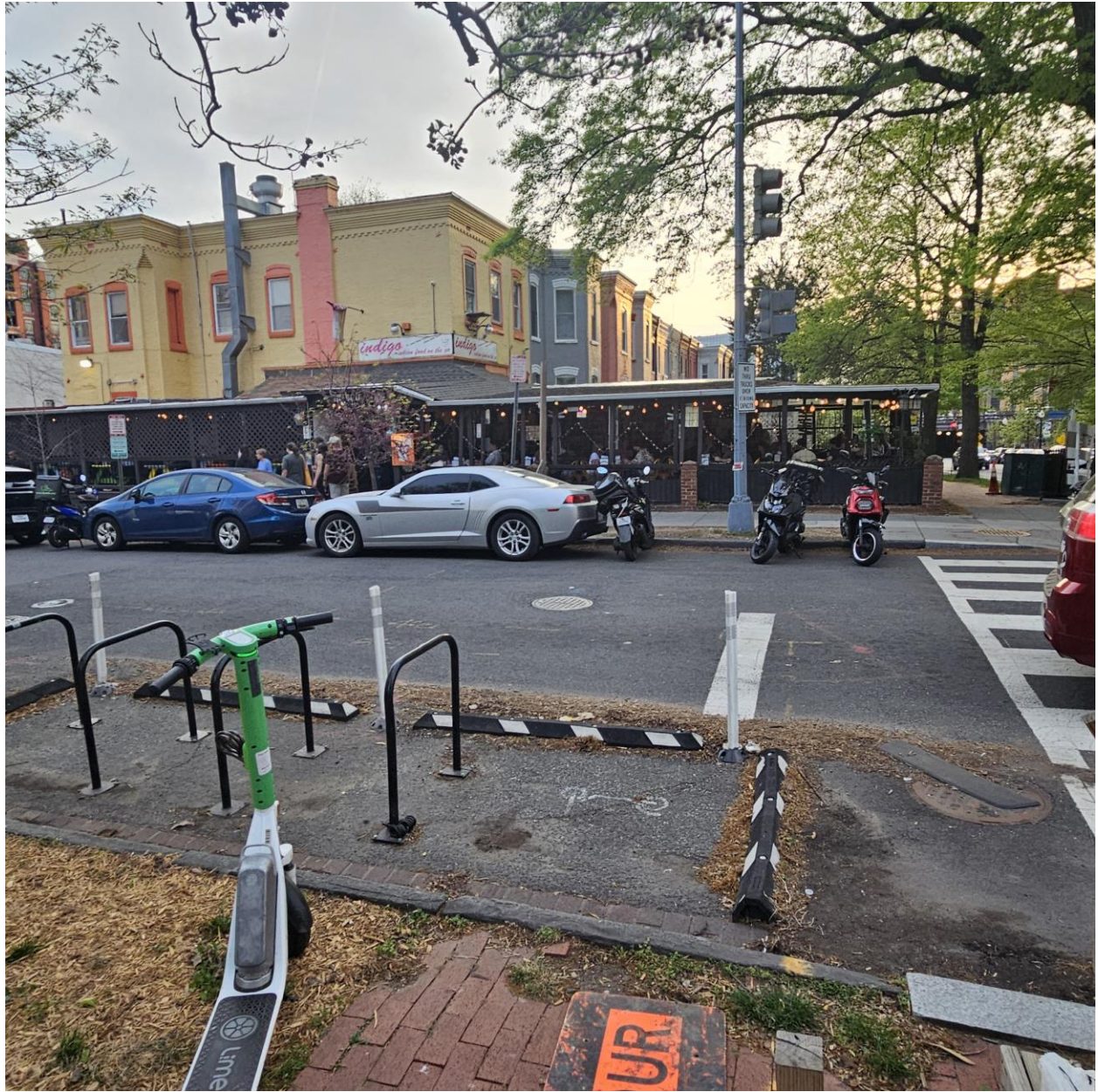
Mopeds outside of parking zone.