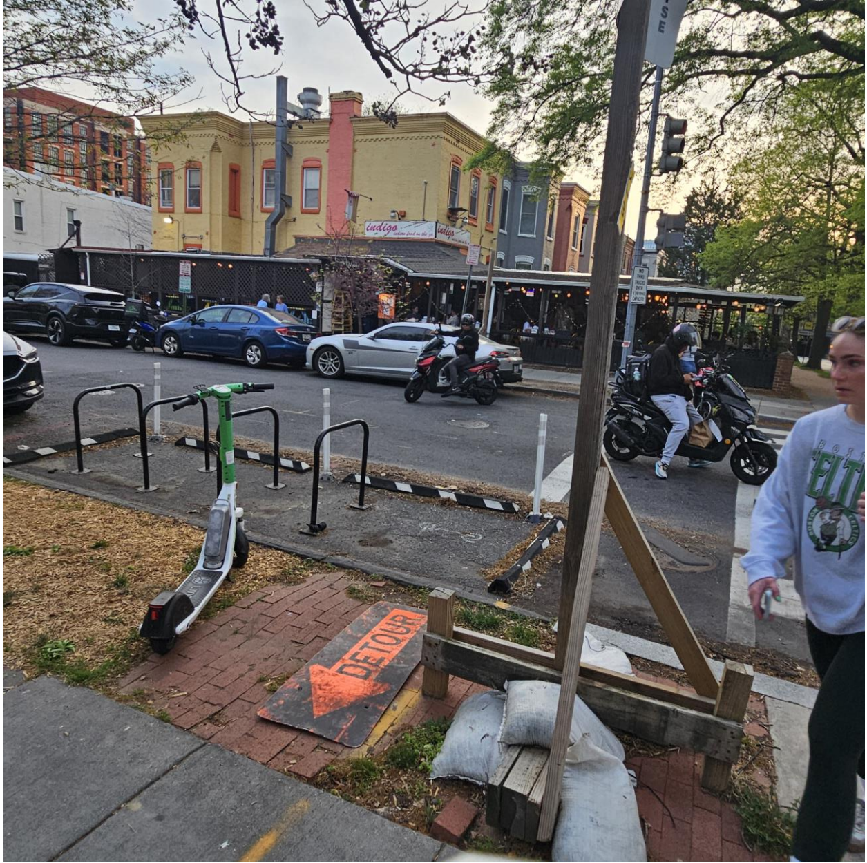
Note parking sign and four delivery mopeds. Three of the four executed u turns and encroached the crosswalk.