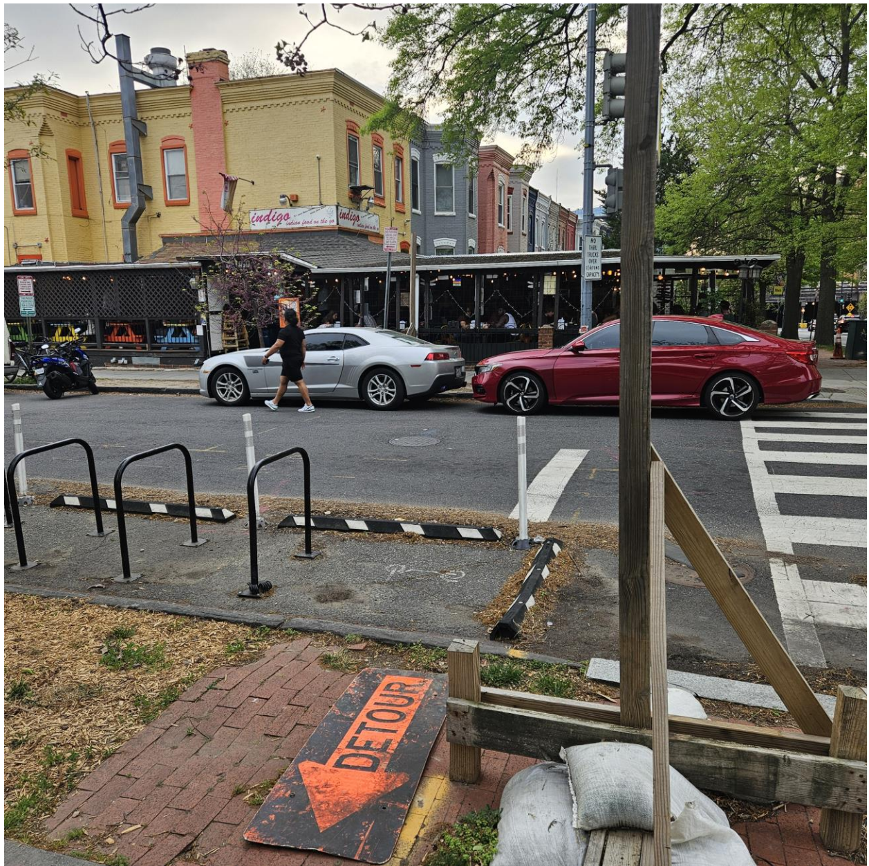
Driver of red car went into restaurant and came out ten minutes later with take away.