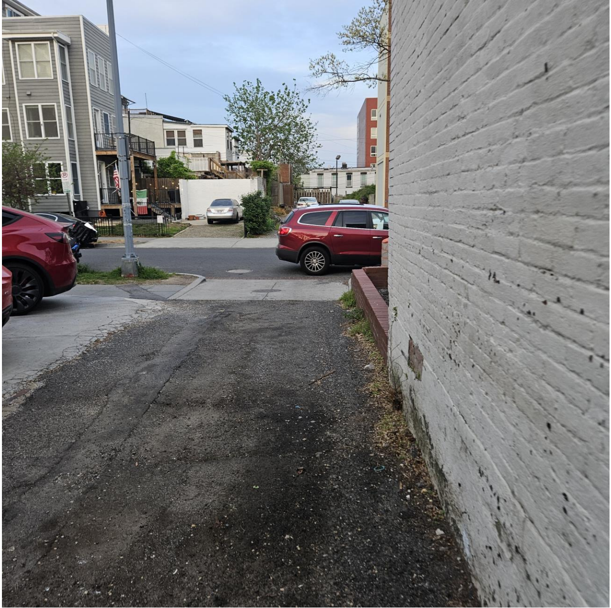
Driver parked car and entered restaurant. I left after ten minutes.