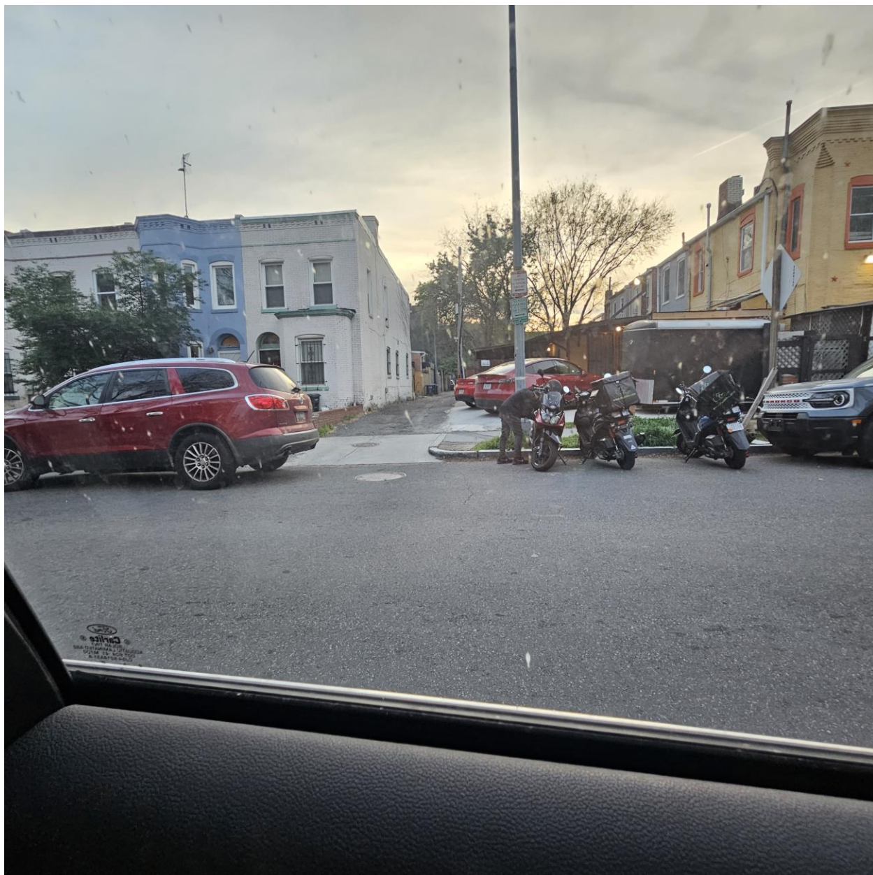
Each driver went in to the restaurant.