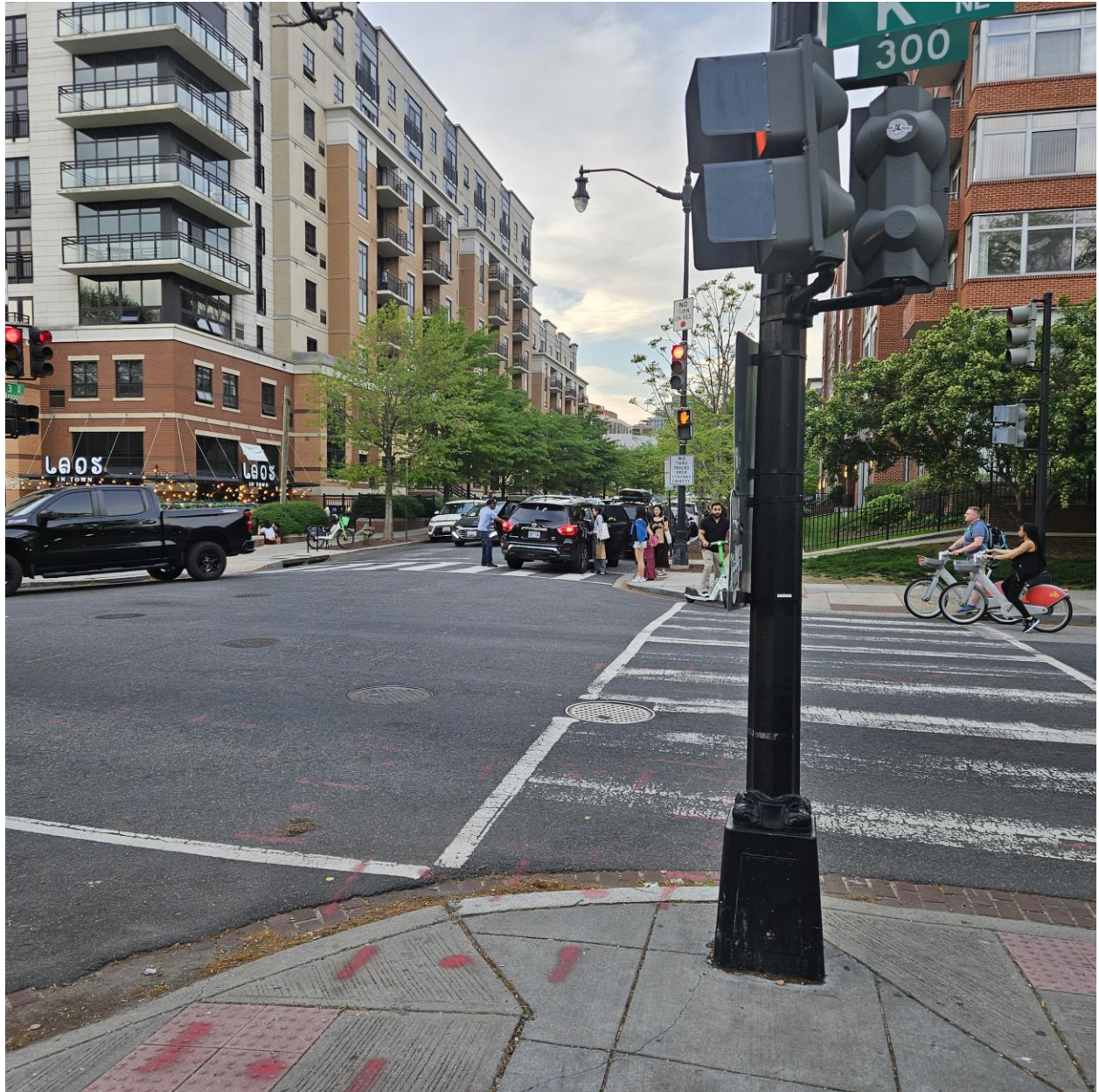
Neighborhood significantly different than Bryant Street. Also, Uber / Lyft dropping off patrons which went to Indigo, in crosswalk at intersection.