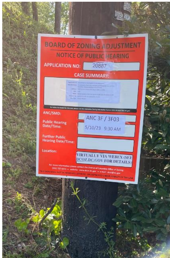
4/24/2023 – Linnean Ave #2