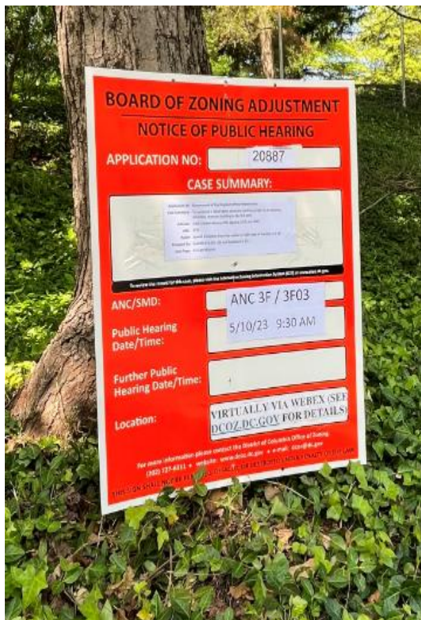
4/24/2023 – Linnean Ave #1