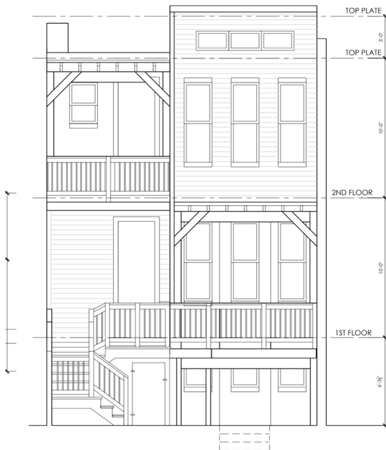
5 PROPOSED REAR ELEVATION

On Thu, Dec 30, 2021 at 9:13 AM Alice Ogden Bellis <aobellis@gmail.com> wrote: