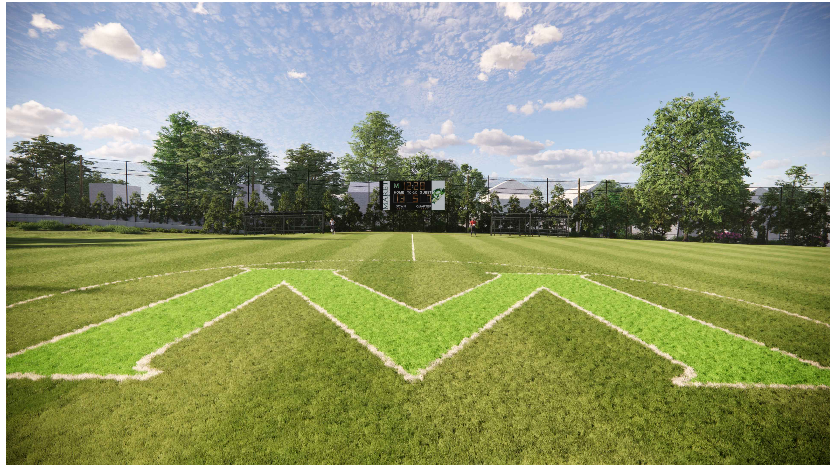
3 VIEW FROM CENTER OF FIELDS LOOKING NORTH CIV0690 N.T.S.