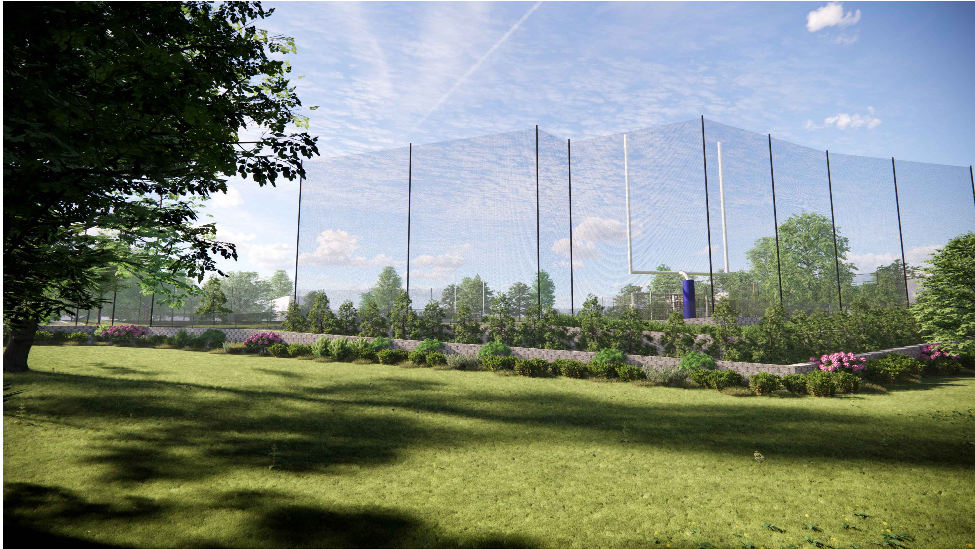
1 VIEW FROM EAST SIDE INTO SITE CIV0690 N.T.S.