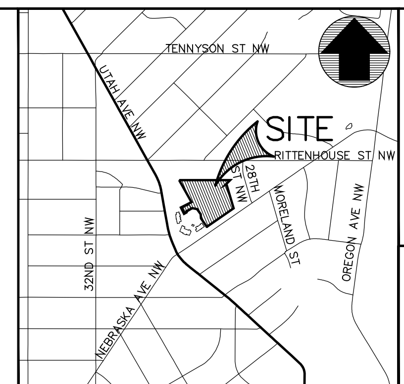
VICINITY MAP SCALE 1" = 1000'

The two bubbled trees are the only two heritage trees planned to be saved in the vicinity of the proposed parking lot. If the parking lot were moved north and the requested zoning exception for minimum setback were not granted, then two more heritage pine trees would be saved and all four nearby heritage trees would be in less distress and have a greater chance of survival.