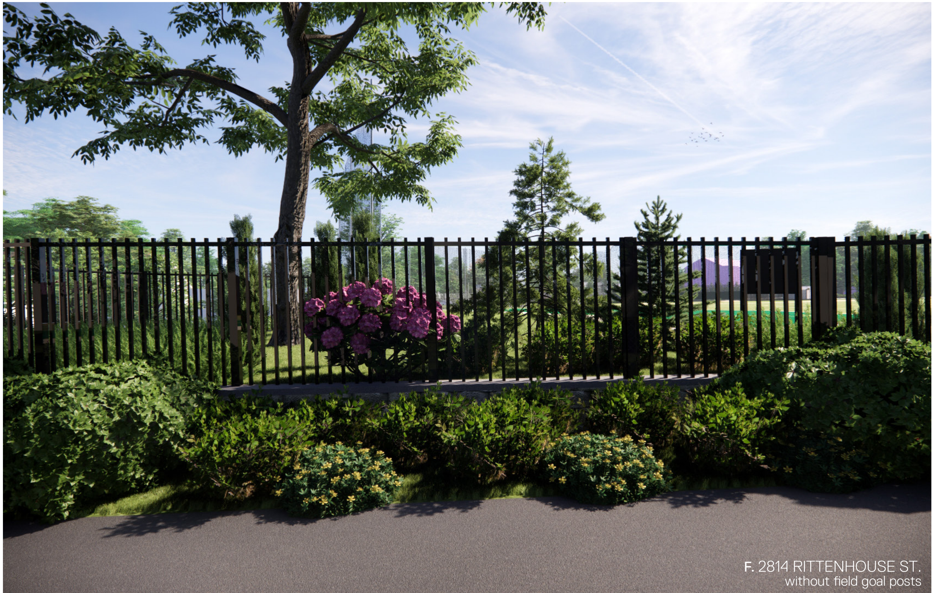
F. 2814 RITTENHOUSE ST. without field goal posts