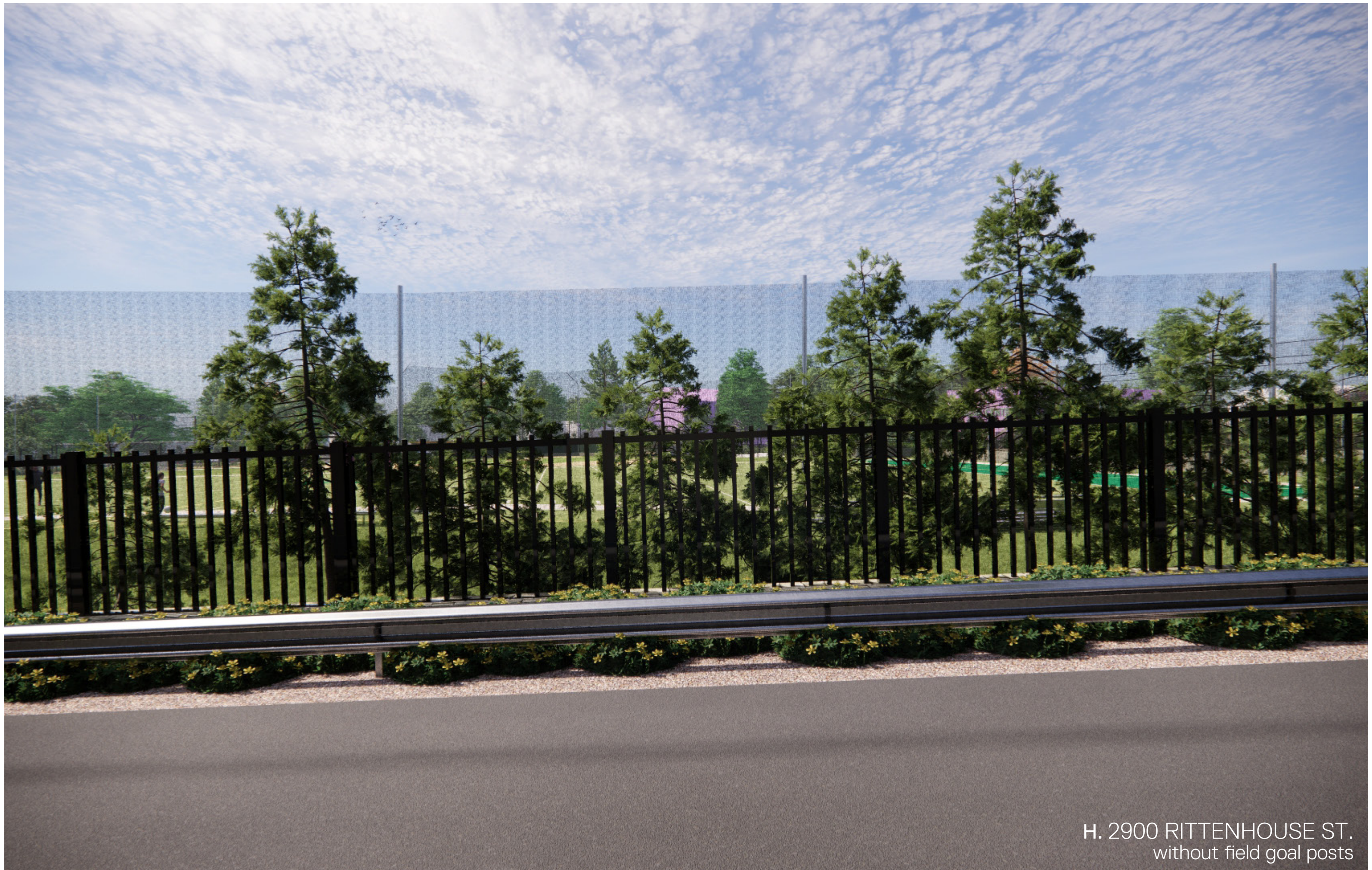
H. 2900 RITTENHOUSE ST. without field goal posts