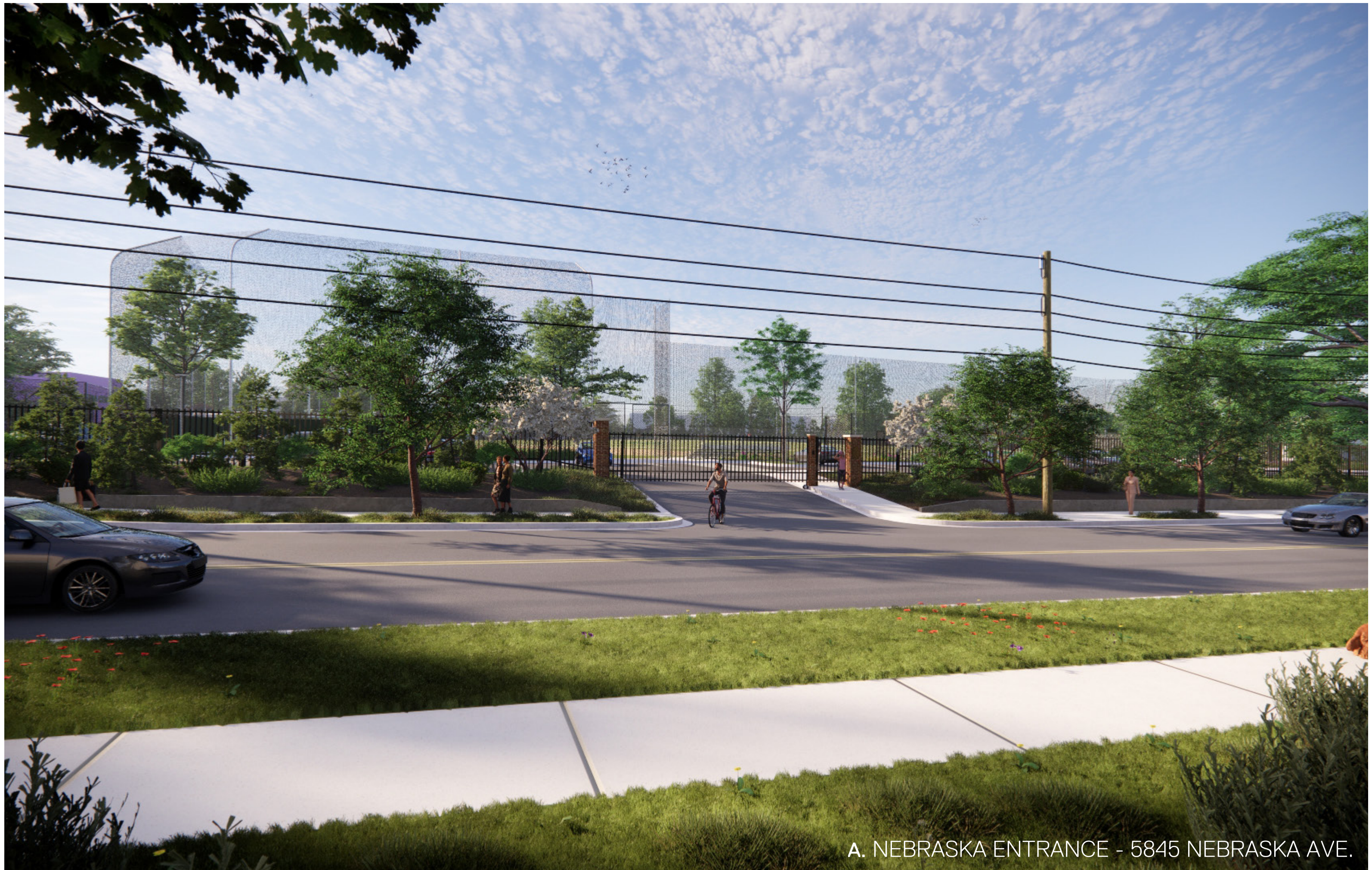
A. NEBRASKA ENTRANCE - 5845 NEBRASKA AVE.