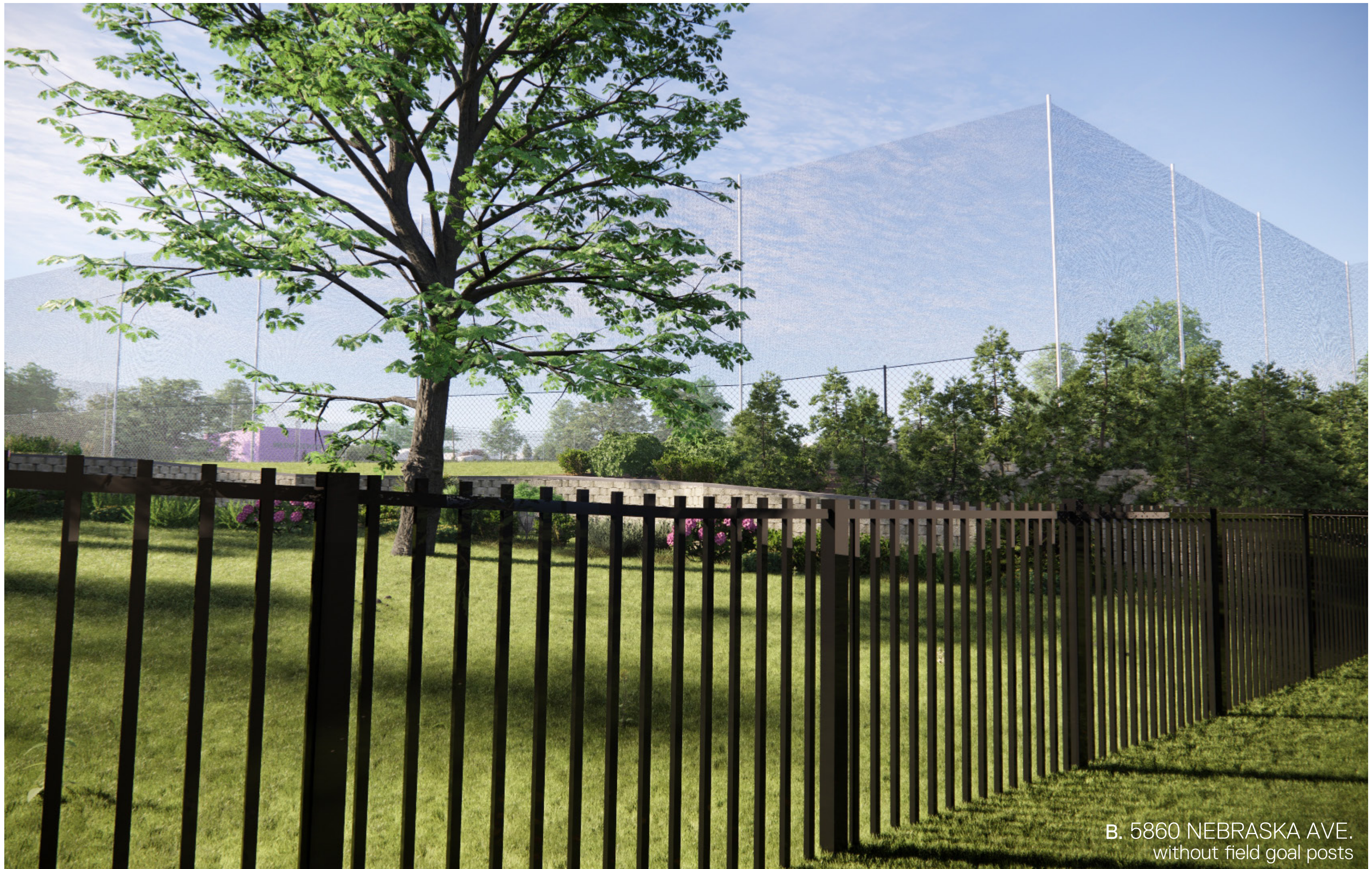
B. 5860 NEBRASKA AVE. without field goal posts