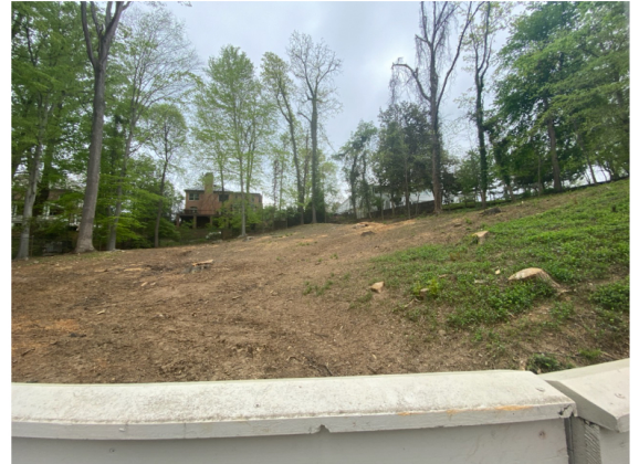
removed site vegetation