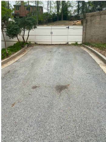
direct view of front entry