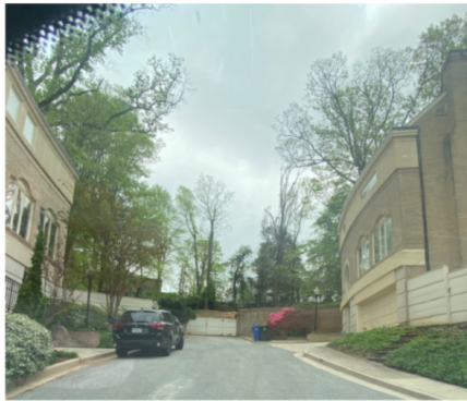
direct view of front entry