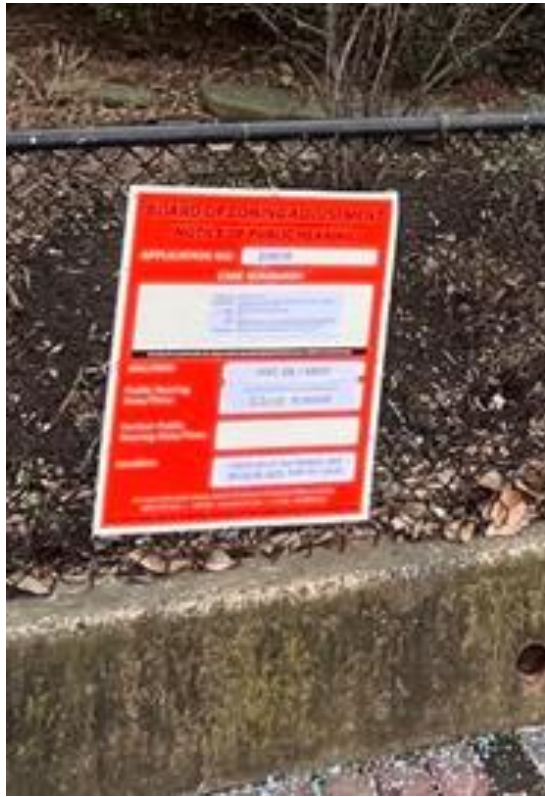
1/19/2022 D Street SE