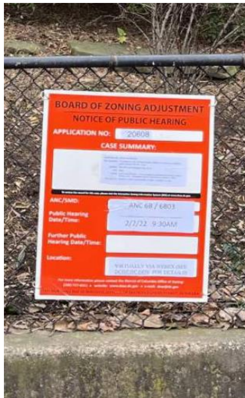
2. 1/14/2022 D Street SE