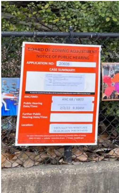
1. 1/14/2022 7 th Street SE