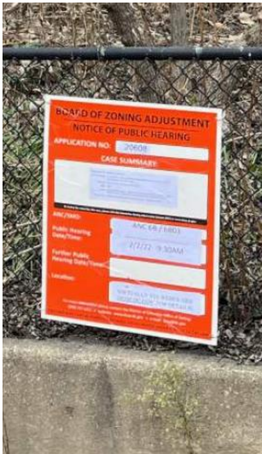
3. 1/14/2022 S. Carolina Ave SE