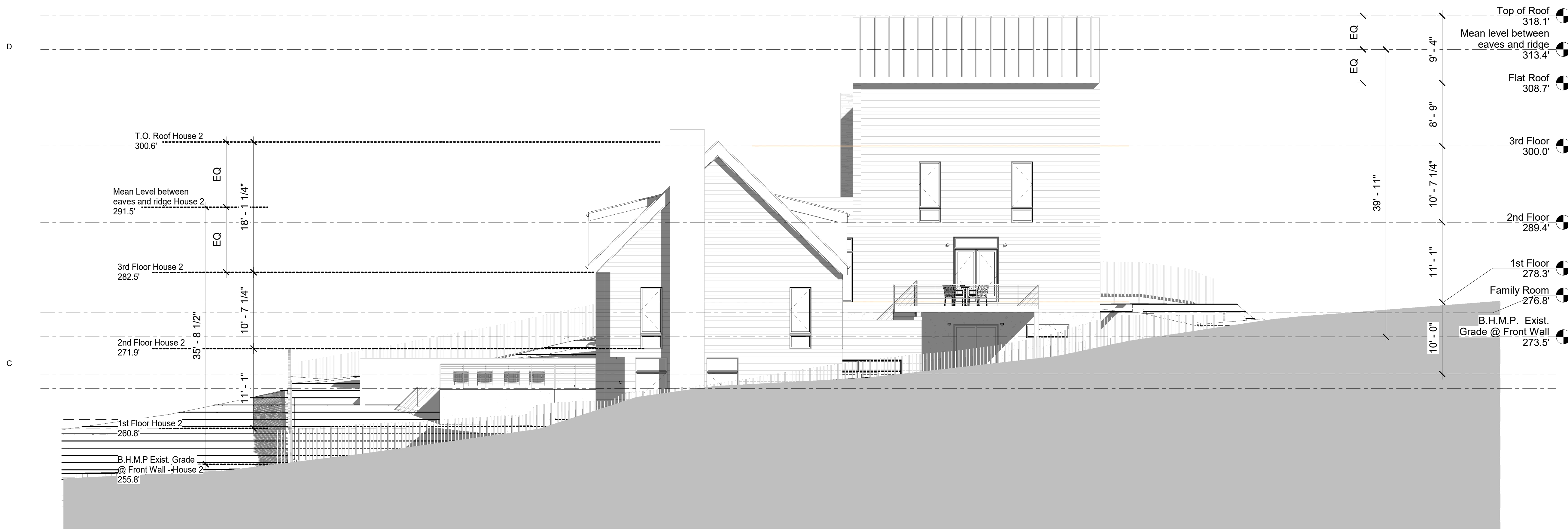
02 East Site Elevation SCALE: 1/8" = 1'-0"