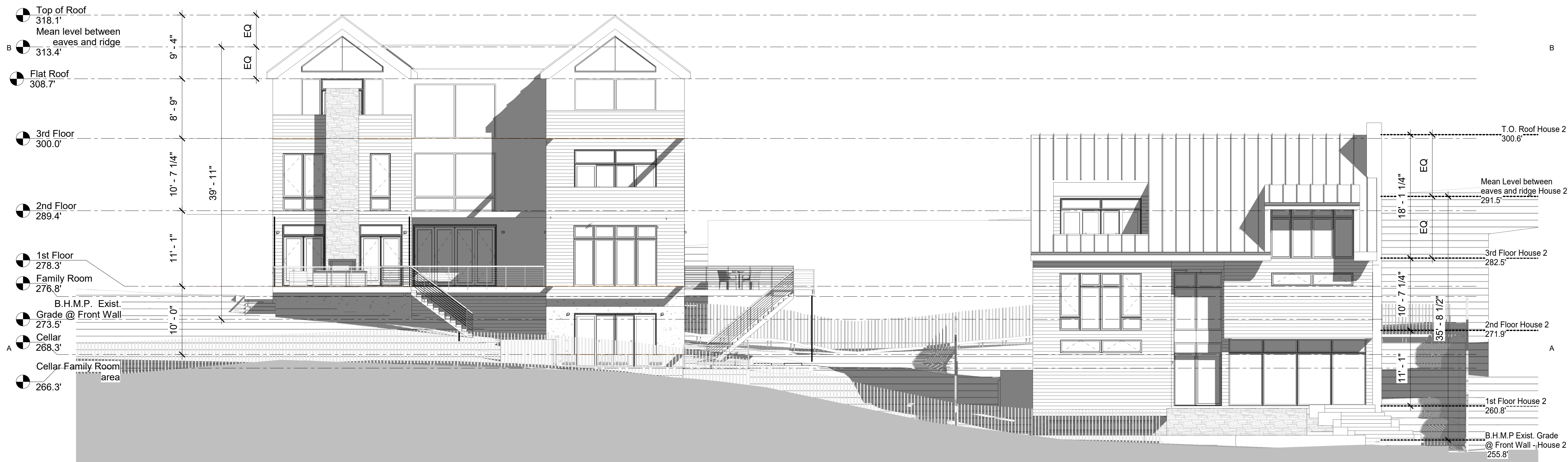
01 South Site Elevation SCALE: 1/8" = 1'-0"