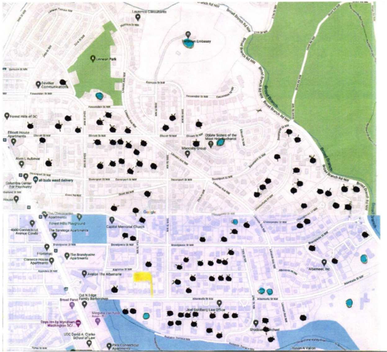
Exhibit 1 Map of Forest Hills that demonstrates properties with minimum 15,000 square foot lots