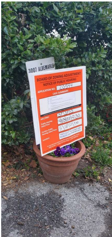
3/31/2022 Albemarle Street NW