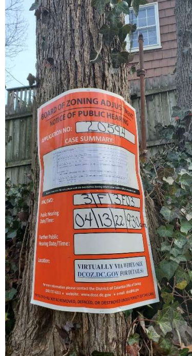
3/13/2022 Appleton Street NW