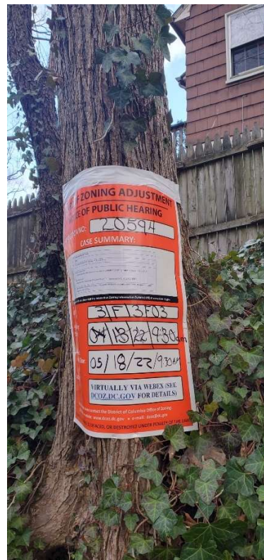
3/31/2022 Appleton Street NW