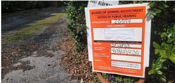
3/13/2022 Albemarle Street NW