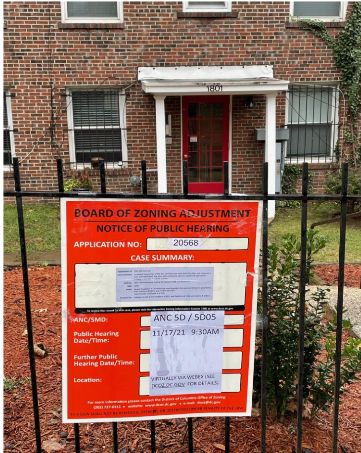
11/2/2021 1801 Maryland Ave NE