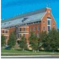
GW NO VA CAMPUS

McDonald's TIK TOK Convenience Stop (RED BOX) , Washington, DC (SiRu) Prototypical design exploration and branding exercise for a clerk-less convenience store.