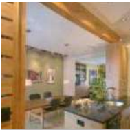
2912 18TH ST