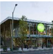
WHOLE FOODS WYNEWOOD

Whole Foods Markets , (MV+A) Project Manager and design team leader for multiple facilities in the Mid-Atlantic Region. Responsibilities included updating technical standards and specifications and response to production quality control and consistency requirements with compressed schedules and delivery times. Responsible for multiple designs of 40,000 sf building shells and 'tenant' improvement packages, working closely with the WFM team to help shape thoughtful design responses to regional themes and make improvements and renovations to existing stores and warehouse space. Signature store building envelop designs in Wynnewood, PA, Springhouse, PA, Rocky River, OH, and Ashburn, VA.