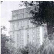
HAMILTON CROWN PLAZA