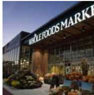
WHOLE FOODS CLEVELAND

Red Derby Café , Washington, DC (SiRu) Expansion studies for a roof top dining area and drawings for sidewalk cafe Public Space approval.