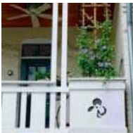
18TH ST PORCH DETAILS