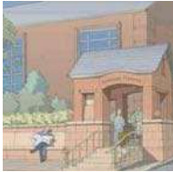
GW MT VVERNON GATE

The American University, Fine Arts Building - Washington, DC (KCF) 25,000 SF addition for new faculty offices, galleries, painting, drawing and dance studios. Not built.