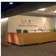
MATTHEWS MEDIA GROUP

IBM Divisional Headquarters- Rockville, MD (KCF) 250,000 SF Construction Administration of shell building. Project Architect, design and CA services of corporate offices.