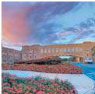
VIRGINIA TECH ACITC