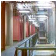
GW NVA CAMPUS