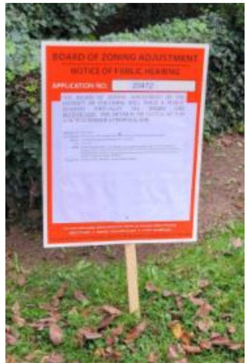
5. 10/11/21 - Nebraska Avenue NW