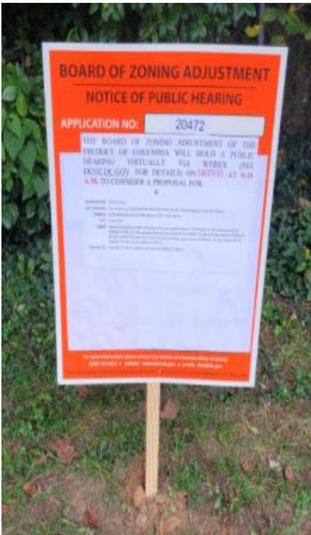
4. 10/11/21 - Nebraska Ave at Van Ness St NW