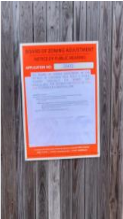
1. 10/11/21 - 42 nd St NW