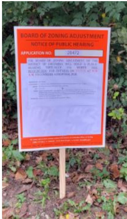
2. 10/11/21- 42 nd St at Van Ness St NW