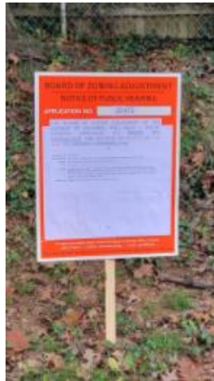
3. 10/11/21- Van Ness St NW