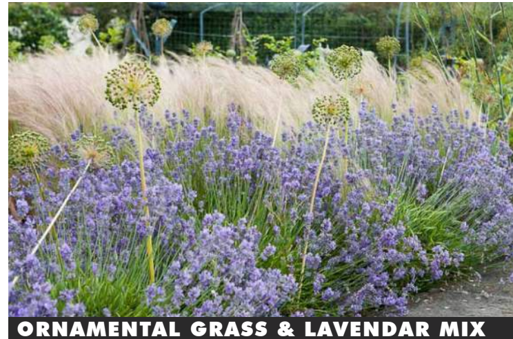
ORNAMENTAL GRASS & LAVENDAR MIX