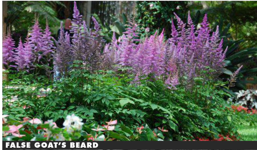
FALSE GOAT'S BEARD