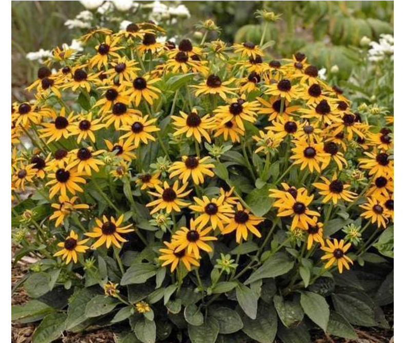
BLACK EYED SUSAN