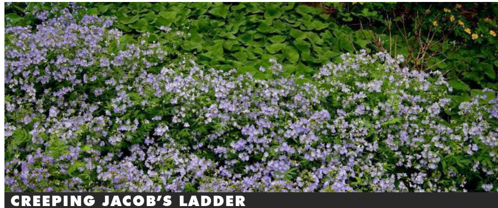
CREeping JACOB'S LADDER