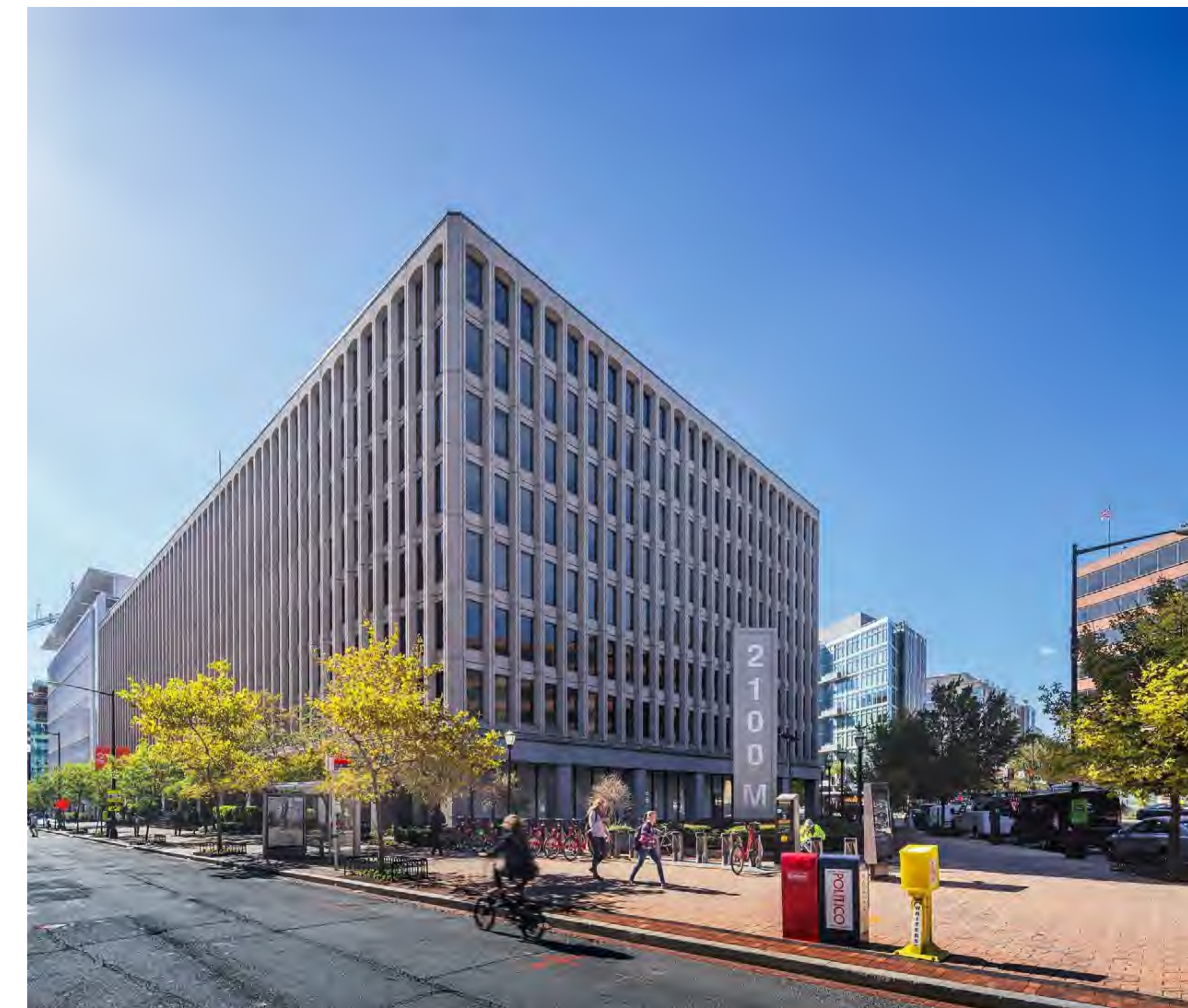
(3) VIEW FROM 21ST STREET CORNER