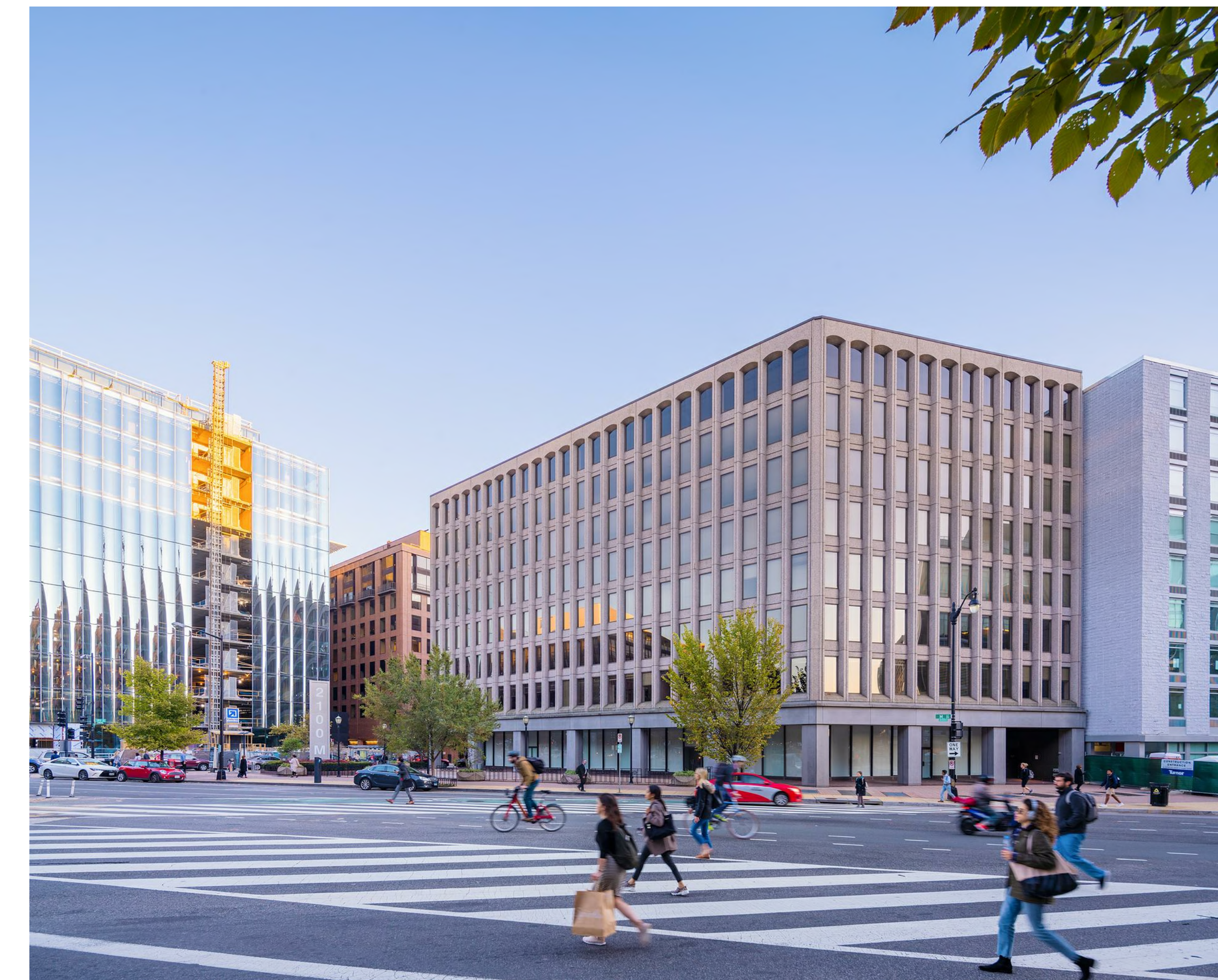
(1) VIEW FROM NEW HAMPSHIRE ST