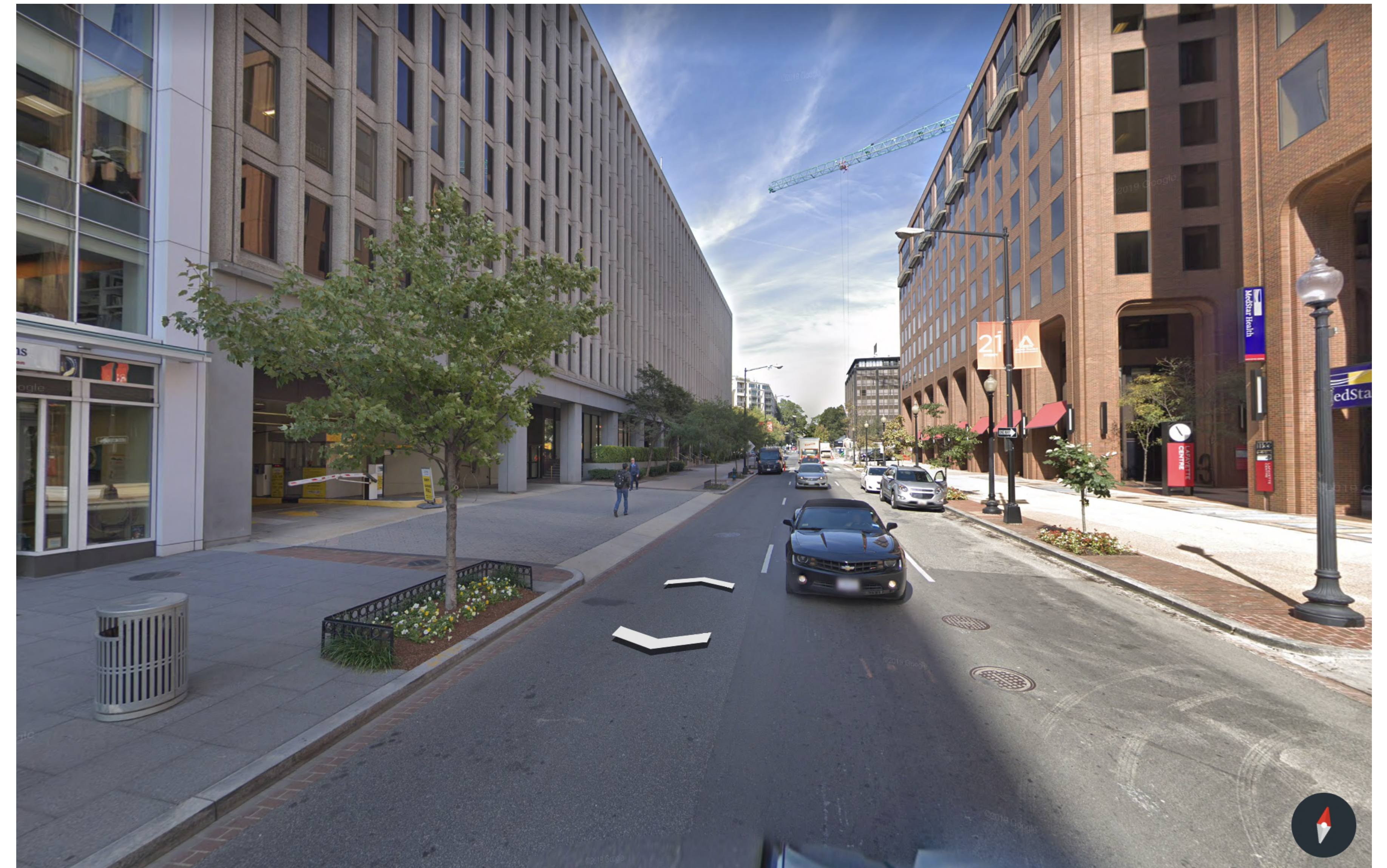
(5) VIEW FROM 21ST STREET