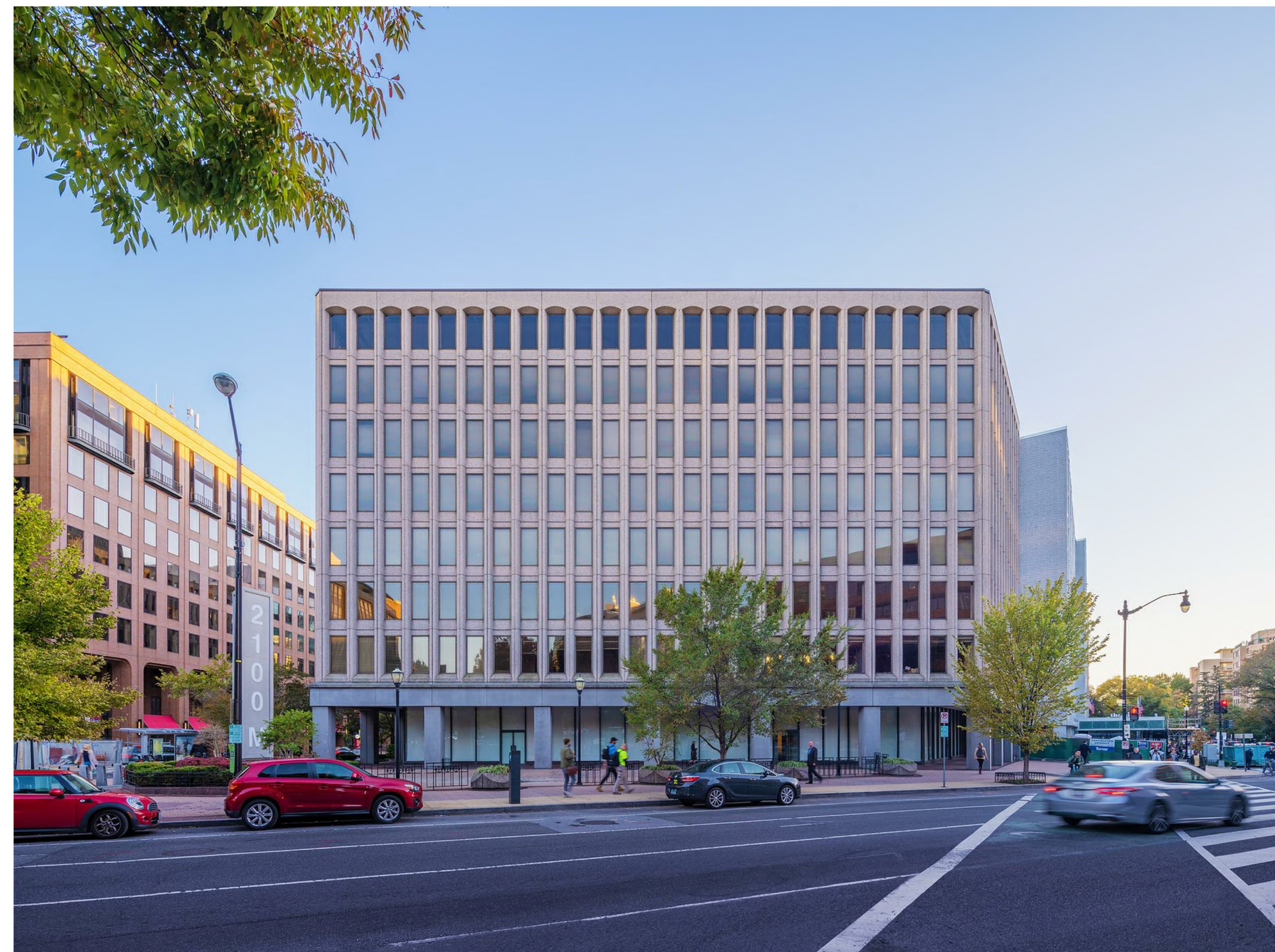
(2) VIEW FROM DUKE ELLINGTON PARK