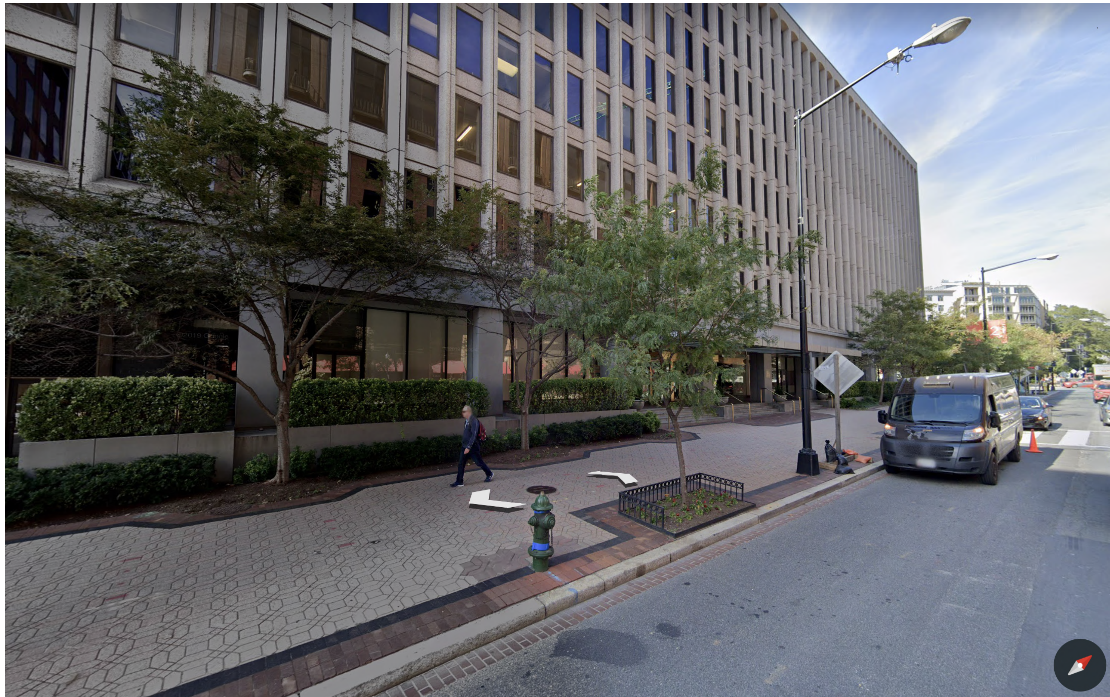
(4) VIEW FROM 21ST STREET