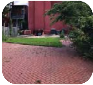
VIEW FROM REAR YARD

PAVEMENT/PLANTING AREA EXISTING PLANTING: 1,561 SF EXISTING PAVEMENT: 2,080 SF