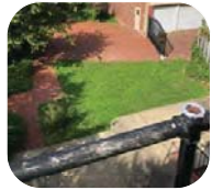
VIEW FROM 2ND FLOOR