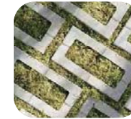
TECHO BLOC PAVER