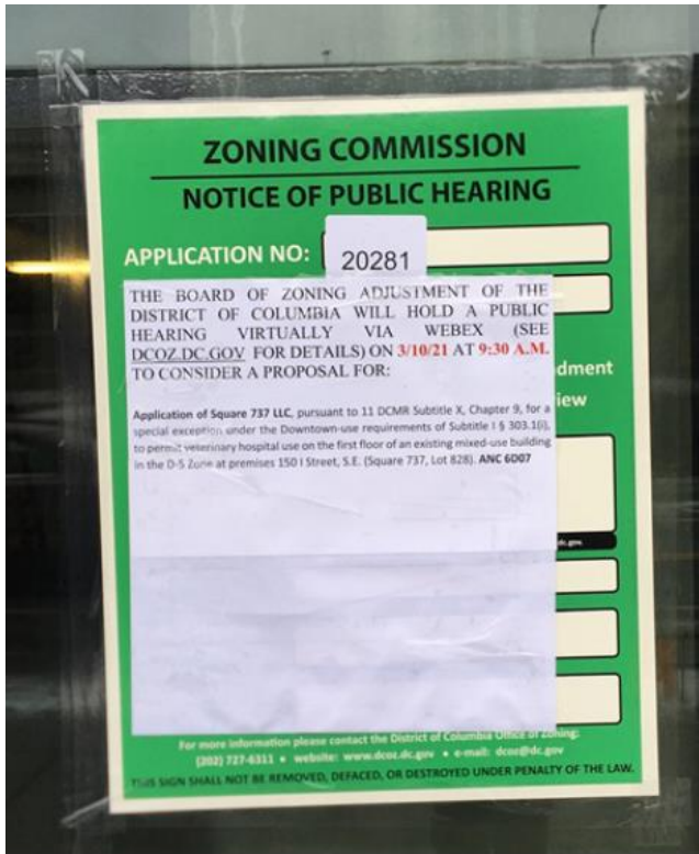
3. 2/22/2021 H Street SE