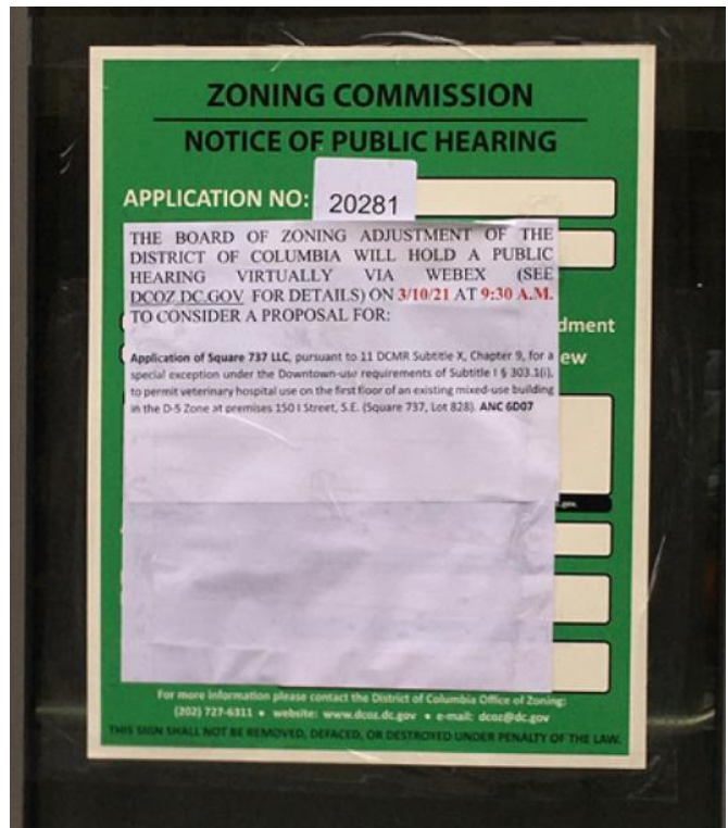
2. . 2/22/2021 2 nd Street SE