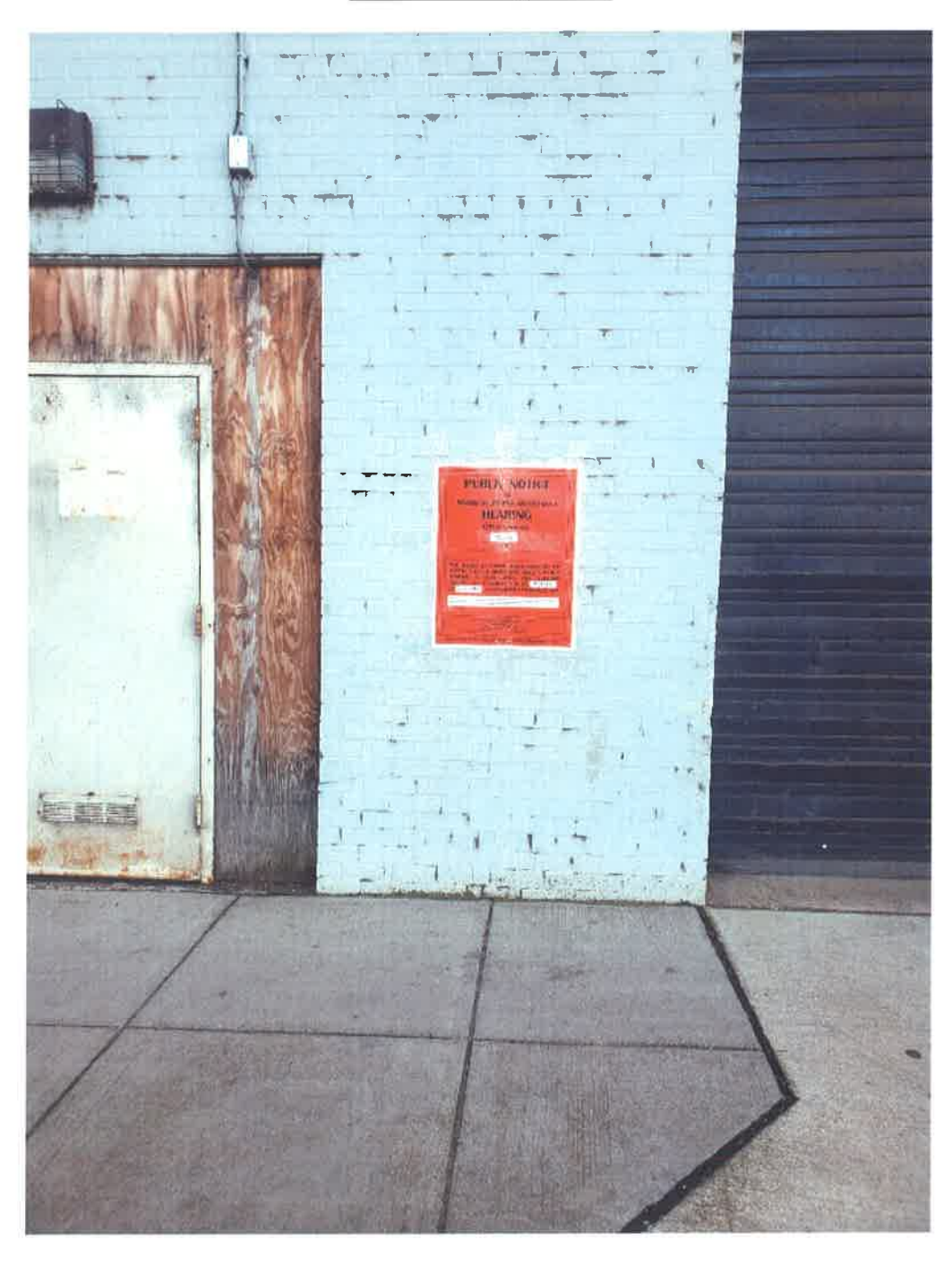
Figure 1 – Sign #1 – Water Street, NW – March 16, 2020