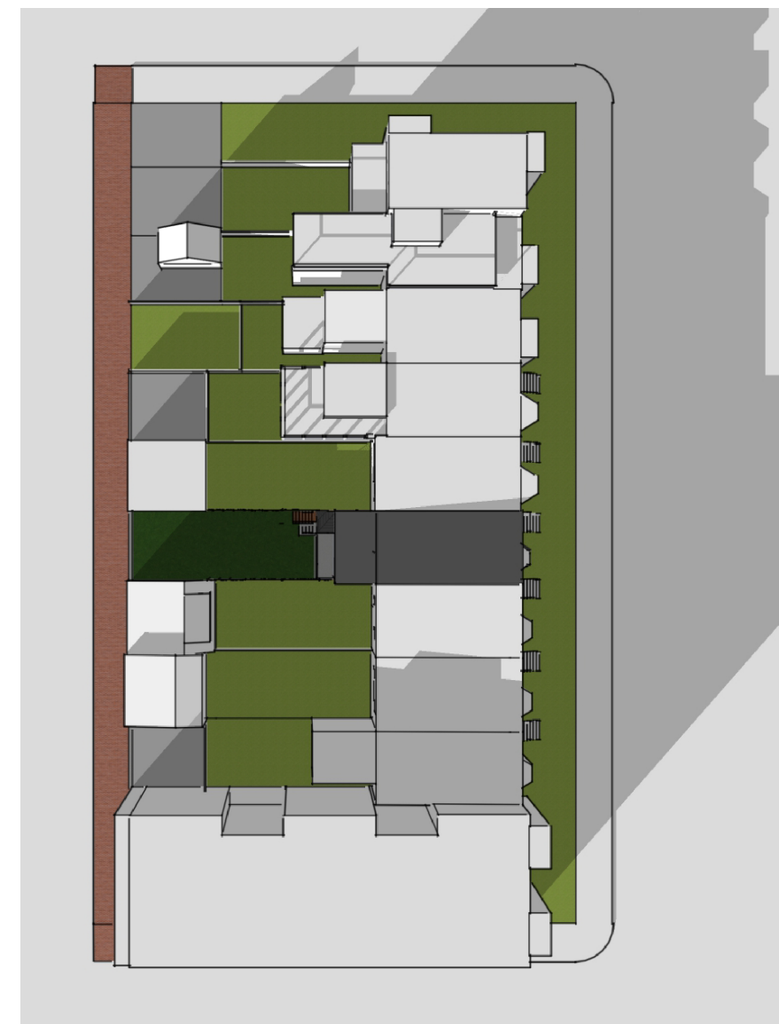
Matter of Right