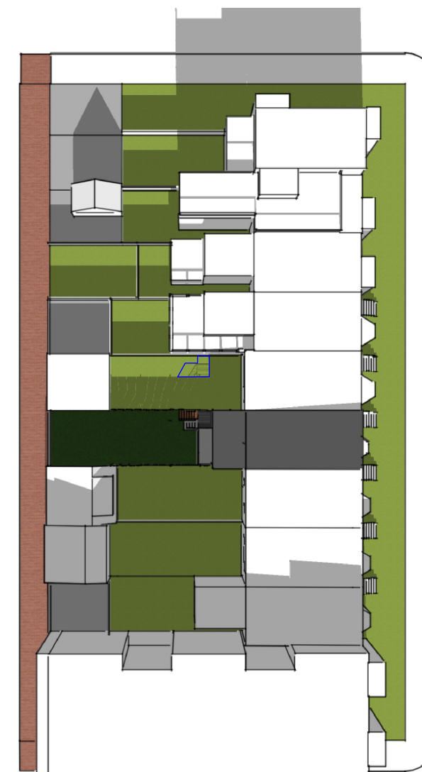
— ADDITIONAL SHADE FROM PROPOSED