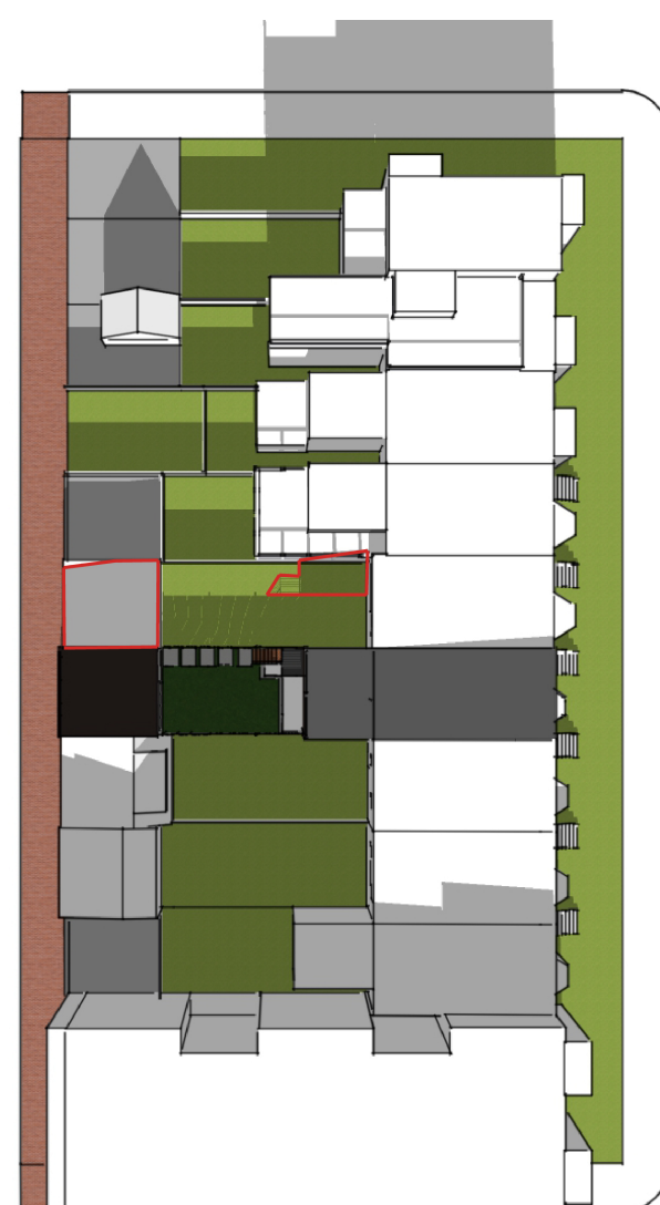
— ADDITIONAL SHADE