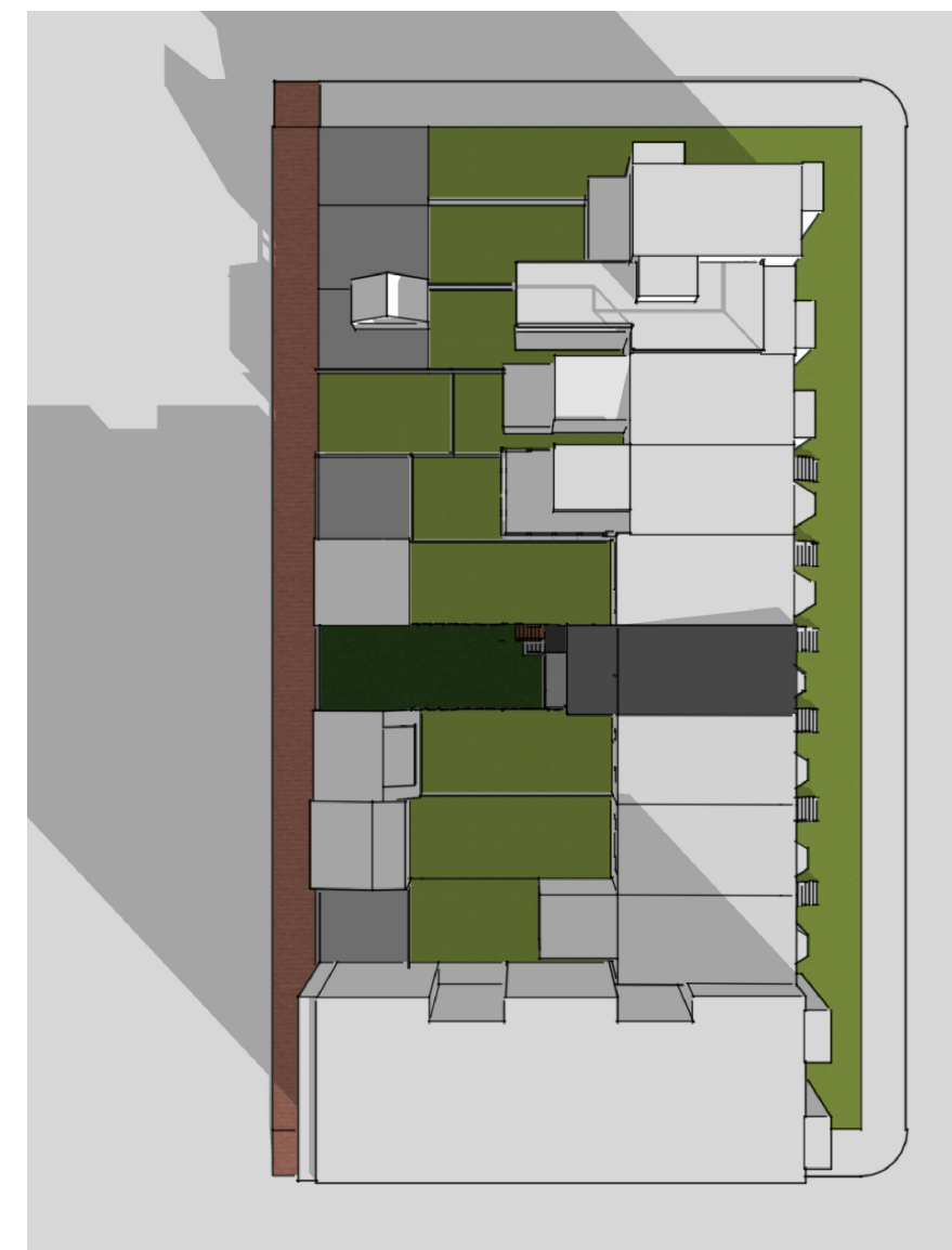
Matter of Right