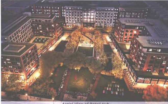
Aerial View of Retail Hub