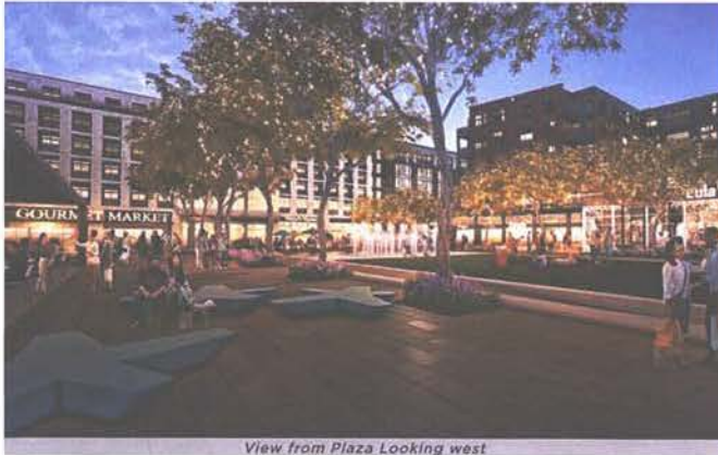
View from Plaza Looking west