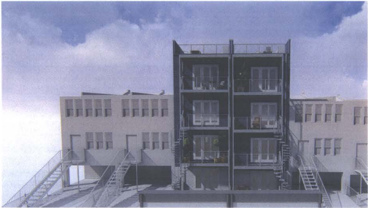
June 21 st , 5 PM