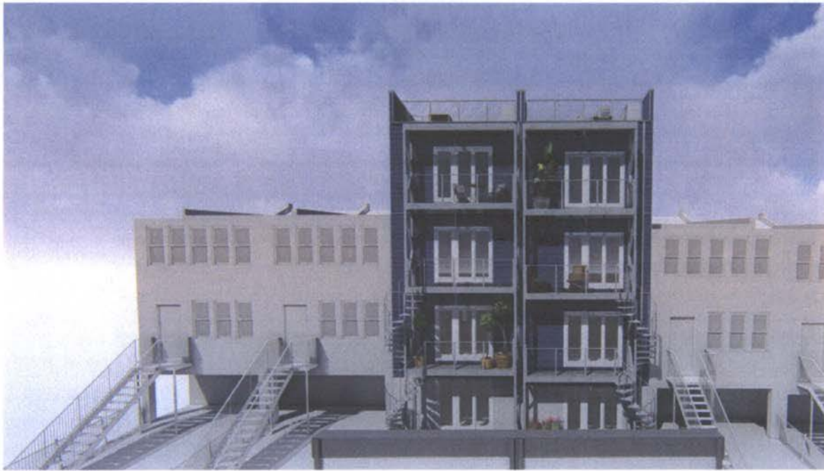
June 21 st , 3 PM