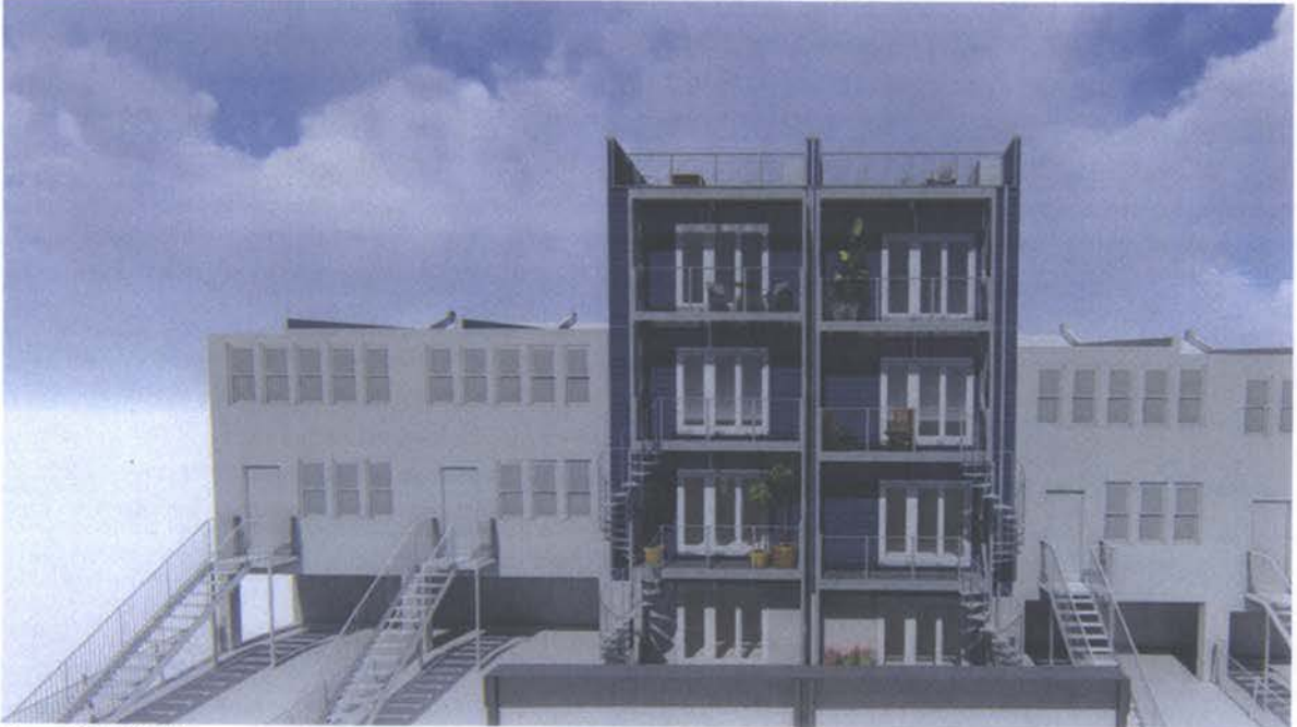
June 21 st , 2 PM