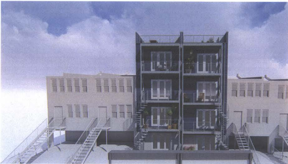
June 21 st , 11 AM