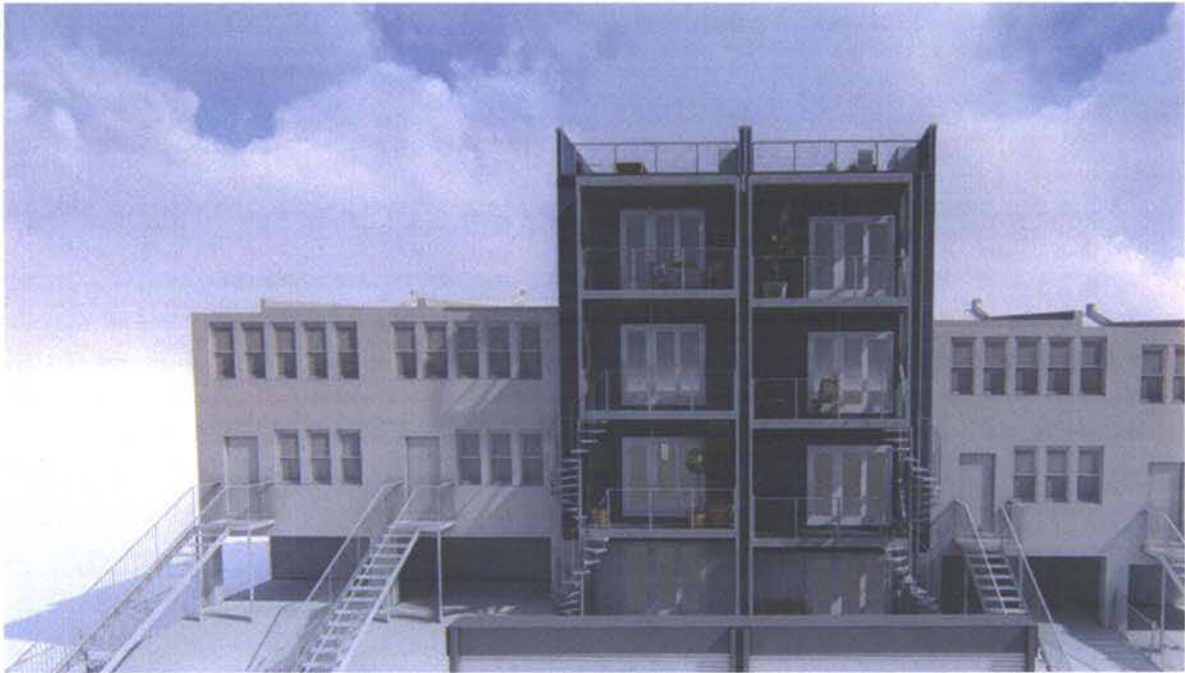
June 21 st , 9 AM