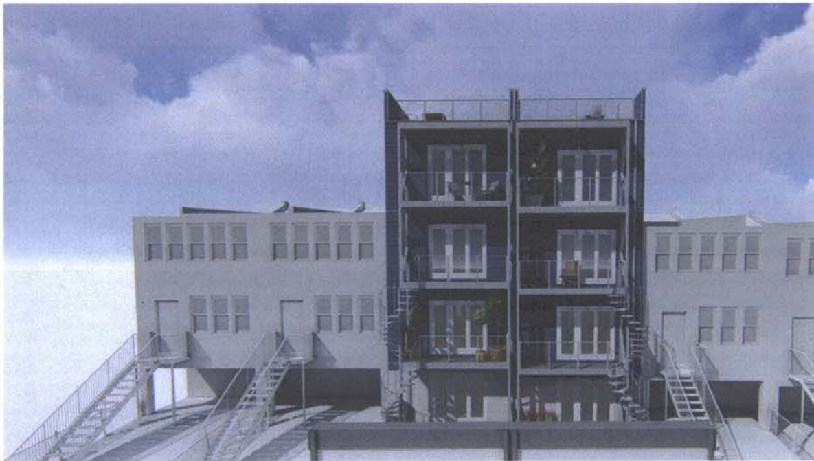
June 21 st , 4 PM