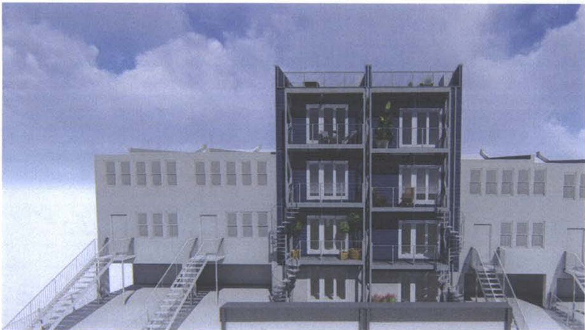
June 21 st , 12 PM