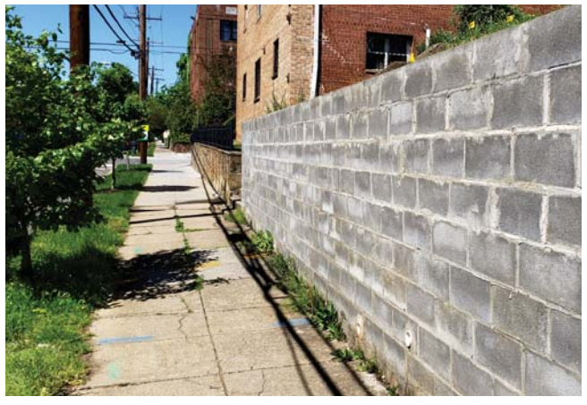
2637 4th St NE (R19126) | ANC Presentation | 18 June 2019