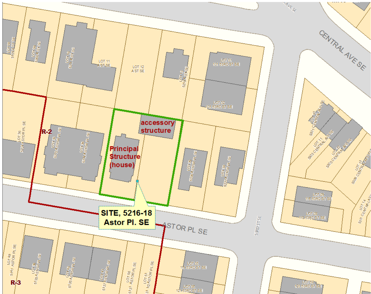
Figure 2. Site Location