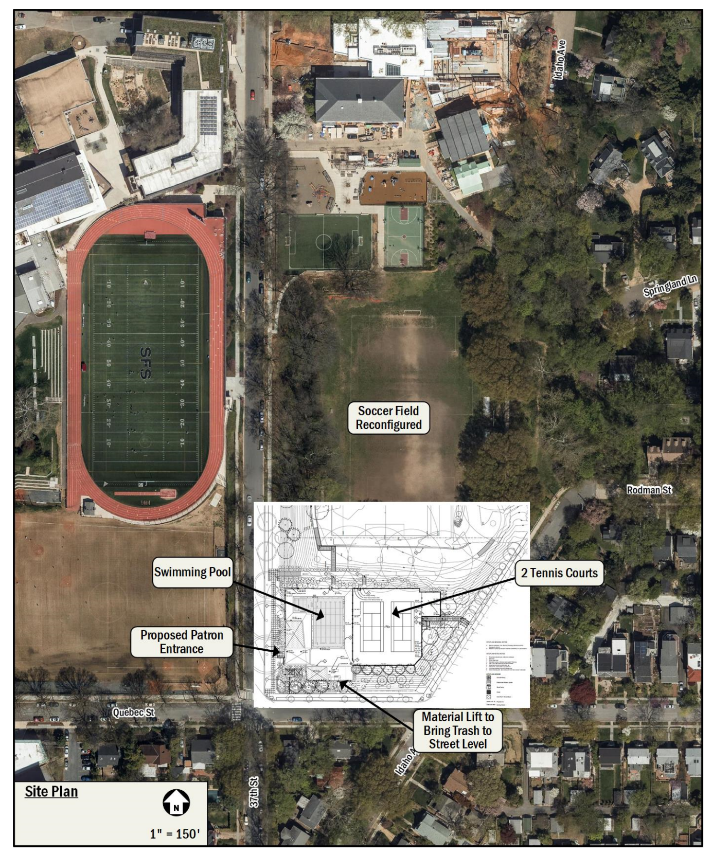
Figure 1: Site Location and Site Plan

Hearst Park and Pool Loading and Curbside Management Plan May 14, 2019