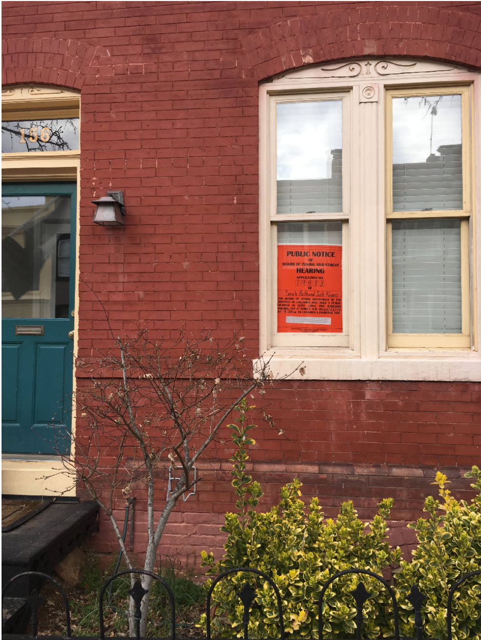
Photograph No. 1