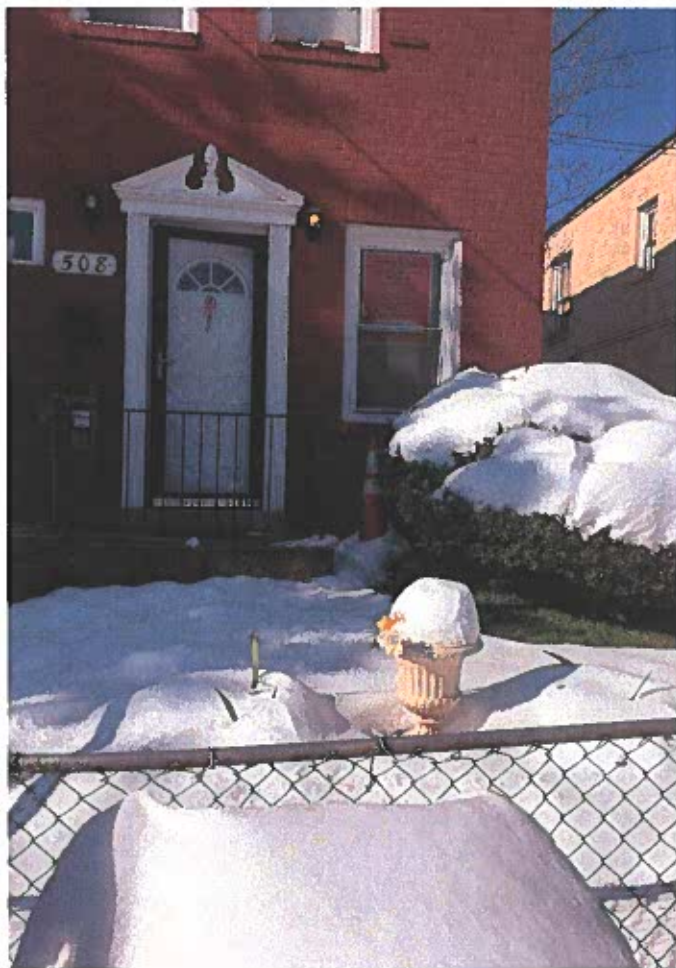
Exhibit AFF 1