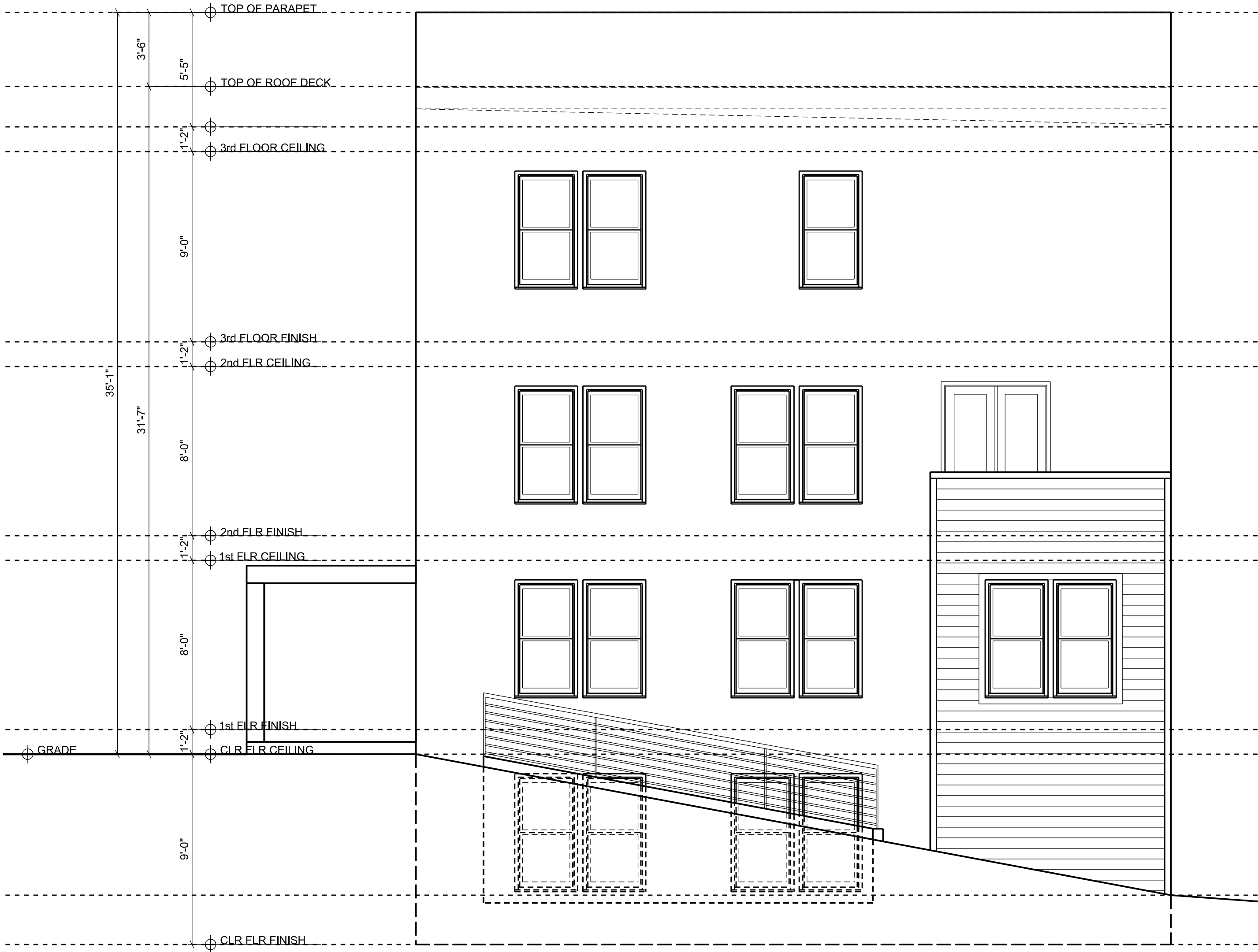
2 WEST ELEVATION - PROPOSED SCALE: 1/4" = 1'-0" 24X36 LAYOUT

AFA|STUDIOS architecture - design - construction management p. 202.220.2437 c. 202.220.2437