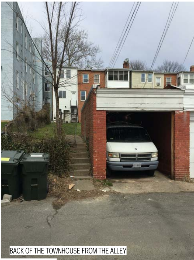
BACK OF THE TOWNHOUSE FROM THE ALLEY