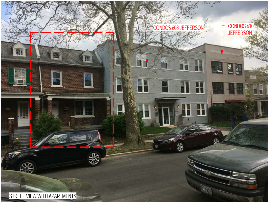
STREET VIEW WITH APARTMENTS