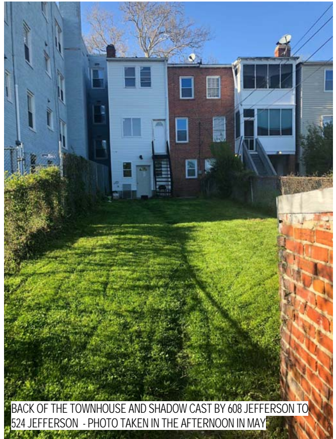
BACK OF THE TOWNHOUSE AND SHADOW CAST BY 608 JEFFERSON TO 524 JEFFERSON - PHOTO TAKEN IN THE AFTERNOON IN MAY