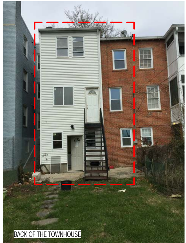
BACK OF THE TOWNHOUSE