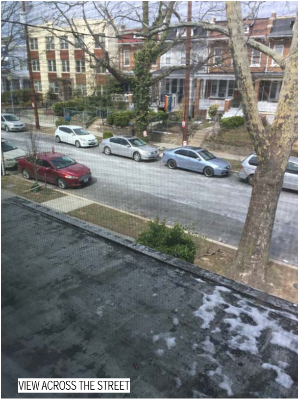
VIEW ACROSS THE STREET