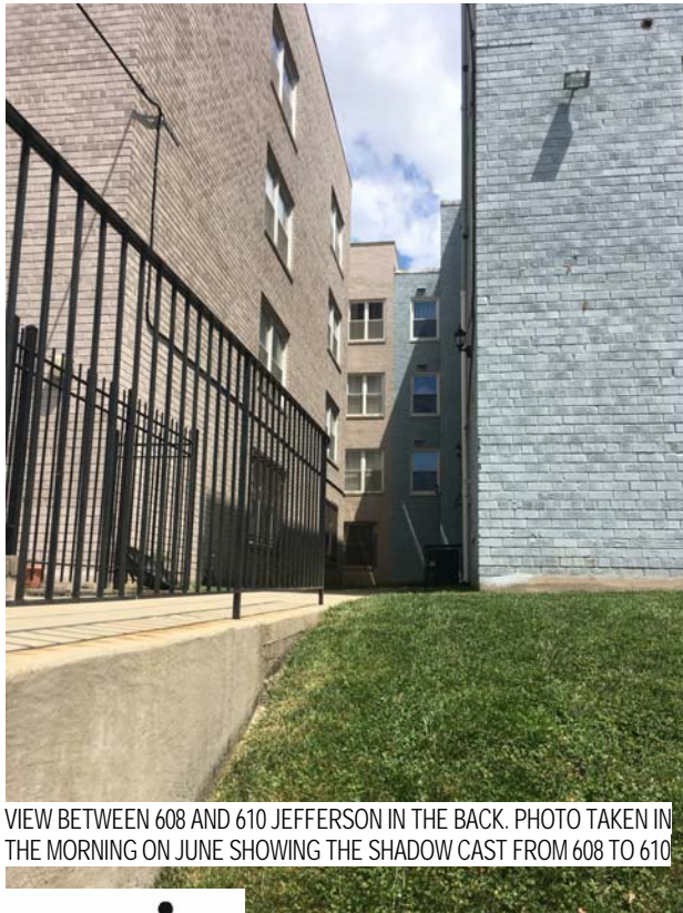
VIEW BETWEEN 608 AND 610 JEFFERSON IN THE BACK. PHOTO TAKEN IN THE MORNING ON JUNE SHOWING THE SHADOW CAST FROM 608 TO 610