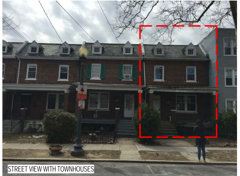
STREET VIEW WITH TOWNHOUSES