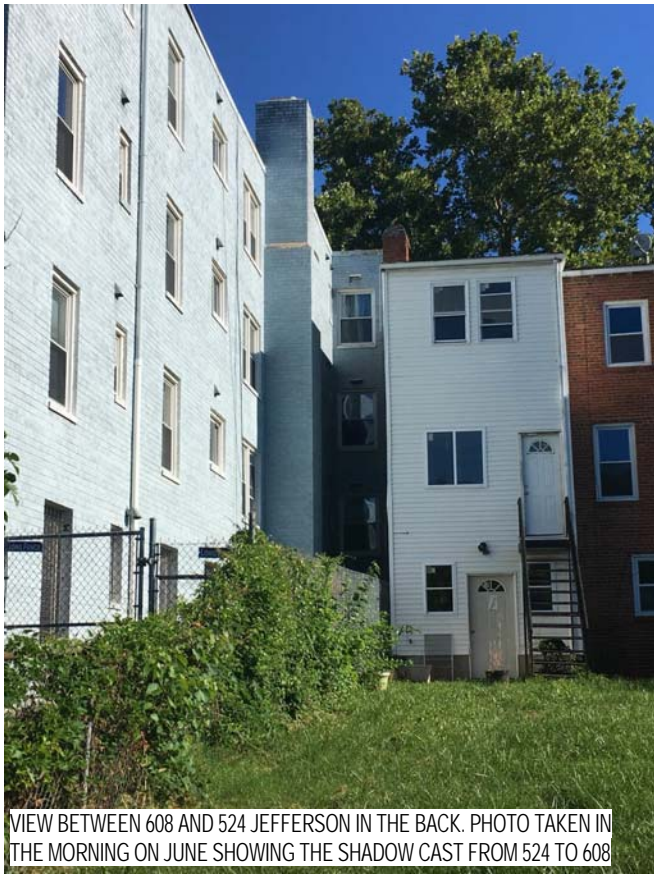
VIEW BETWEEN 608 AND 524 JEFFERSON IN THE BACK. PHOTO TAKEN IN THE MORNING ON JUNE SHOWING THE SHADOW CAST FROM 524 TO 608