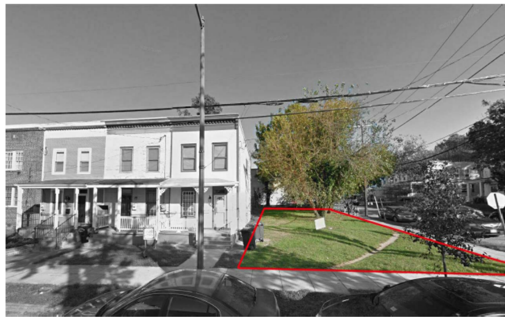
SITE LOOKING EAST FROM 15TH ST. SE