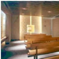
CUA LAW CHAPEL