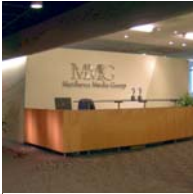
MATTHEWS MEDIA GROUP