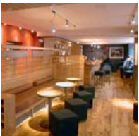
21 P RESTAURANT

McDonald's TIK TOK Convenience Stop (RED BOX) , Washington, DC (SiRu) Prototypical design exploration and branding exercise for a clerk-less convenience store.