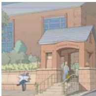
GW MT VWERNON GATE

Building 2 - Nursing Simulation Lab (SiRu) Design of the new lab and study program area.