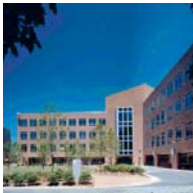
IBM SHADY GROVE OFFICE