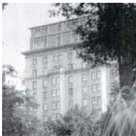
HAMILTON CROWN PLAZA