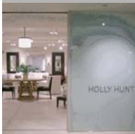
HOLLY HUNT, LTD

George Washington University National Law Center, Washington, DC (KCF) Interior renovations electronic library, faculty offices, dining area, offices and student activity areas.