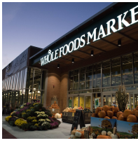
WHOLE FOODS CLEVELAND