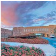
VIRGINIA TECH ACITC