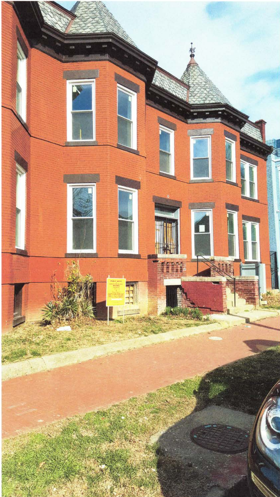
EXHIBIT A-2 CASE# 19718