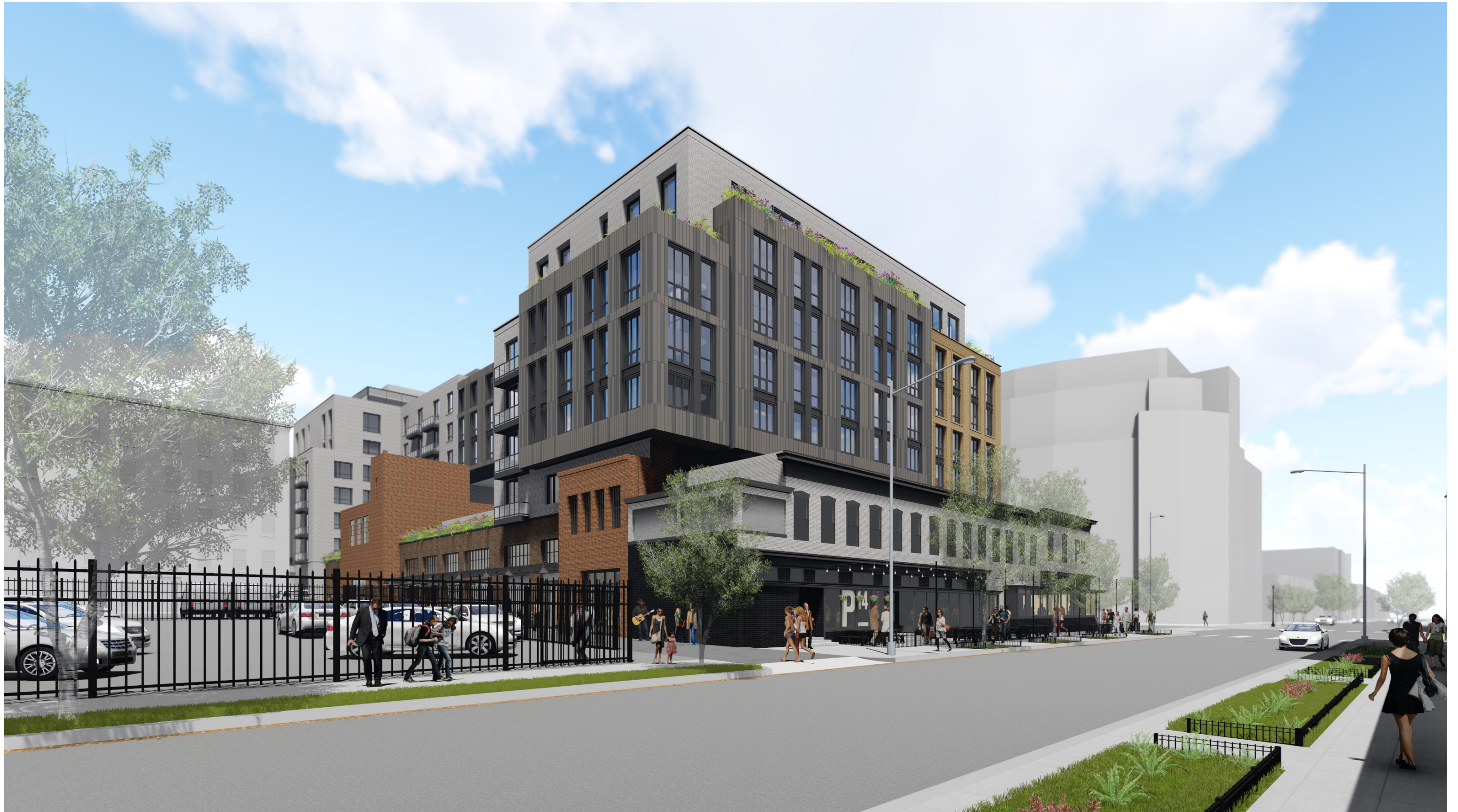
RETAIL ALLEY ENTRANCE ALONG V STREET