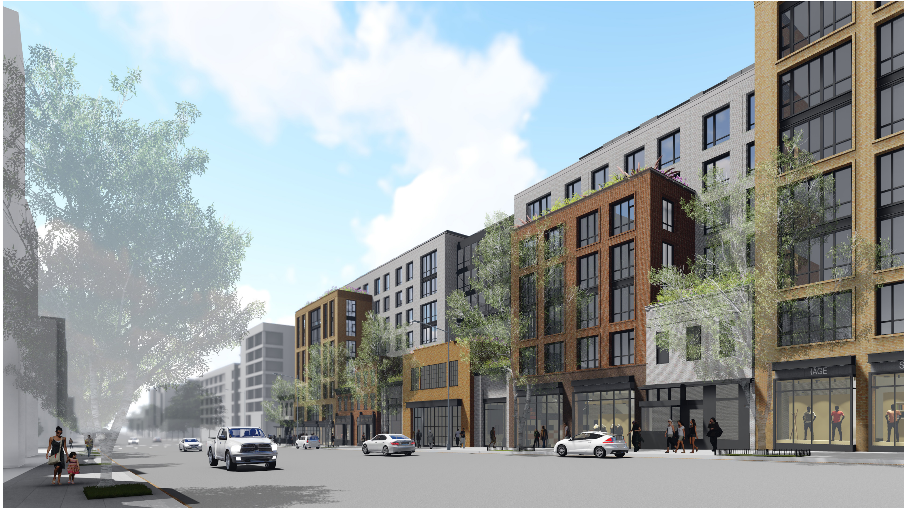
VIEW ACROSS 14TH STREET LOOKING SOUTHWEST