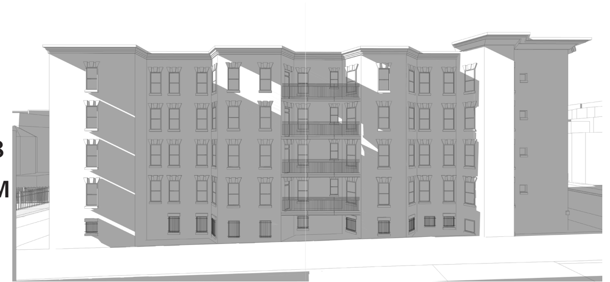
SOLAR ANALYSIS - PREVIOUSLY REQUESTED RELIEF ENVELOPE