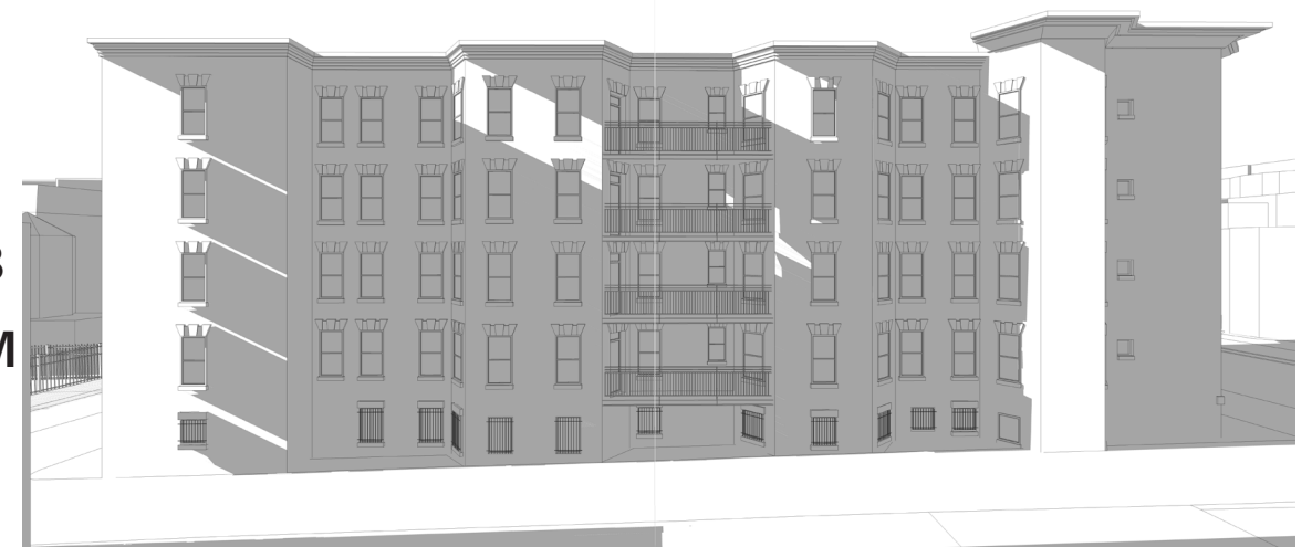
SOLAR ANALYSIS - ZONING-COMPLIANT ENVELOPE