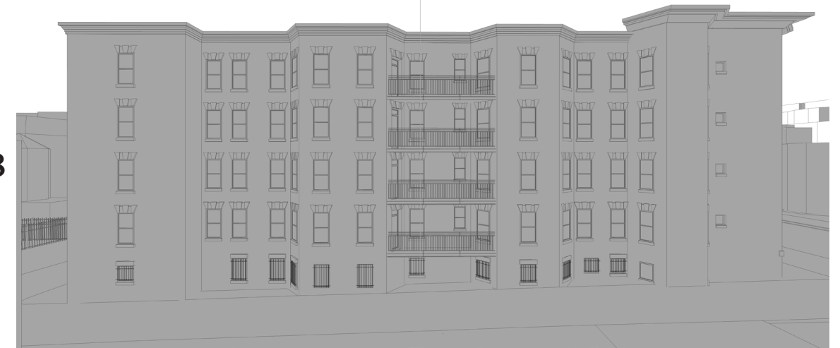
SOLAR ANALYSIS - PREVIOUSLY REQUESTED RELIEF ENVELOPE