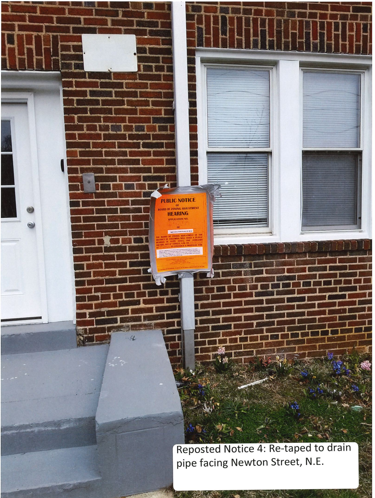
Reposted Notice 4: Re-taped to drain pipe facing Newton Street, N.E.