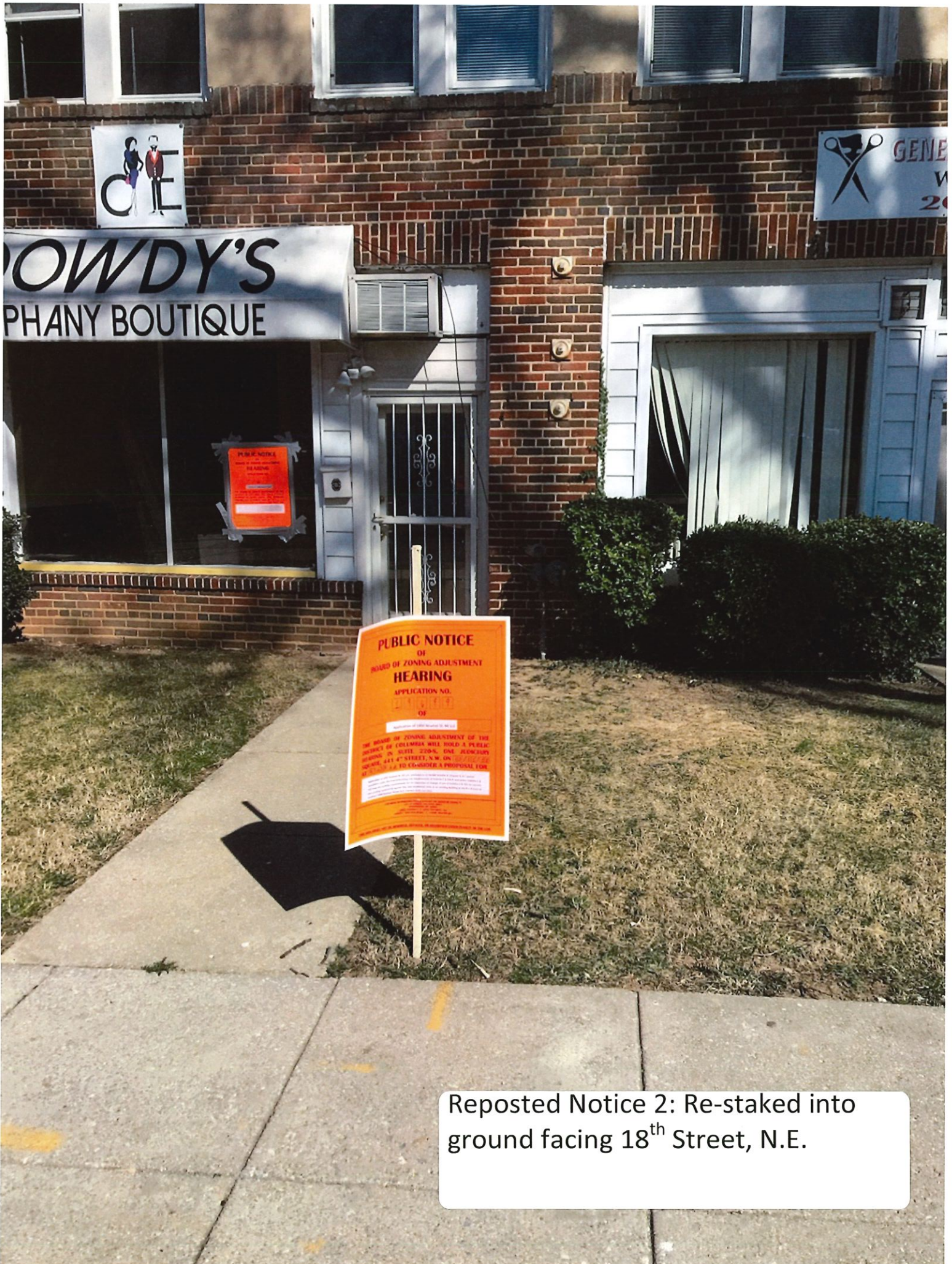
Reposted Notice 2: Re-staked into ground facing 18 th Street, N.E.