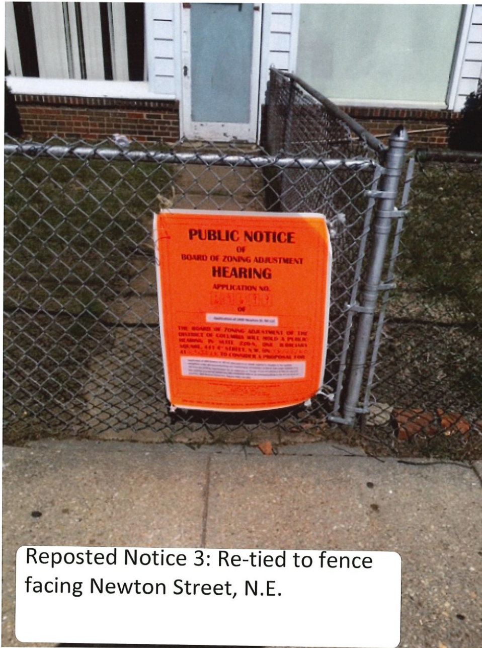
Reposted Notice 3: Re-tied to fence facing Newton Street, N.E.