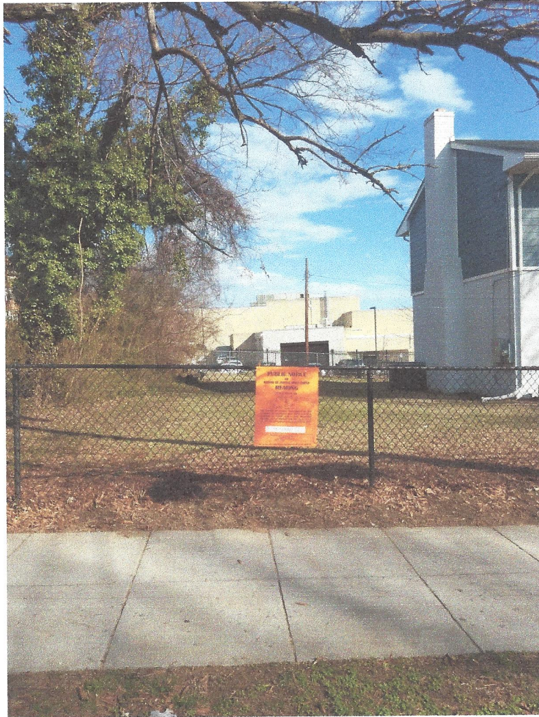
Pic 3 Angle 3 Sign #2