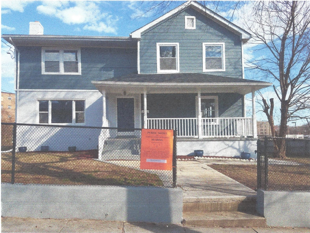
Pic 1 Angle 1 Sign #1