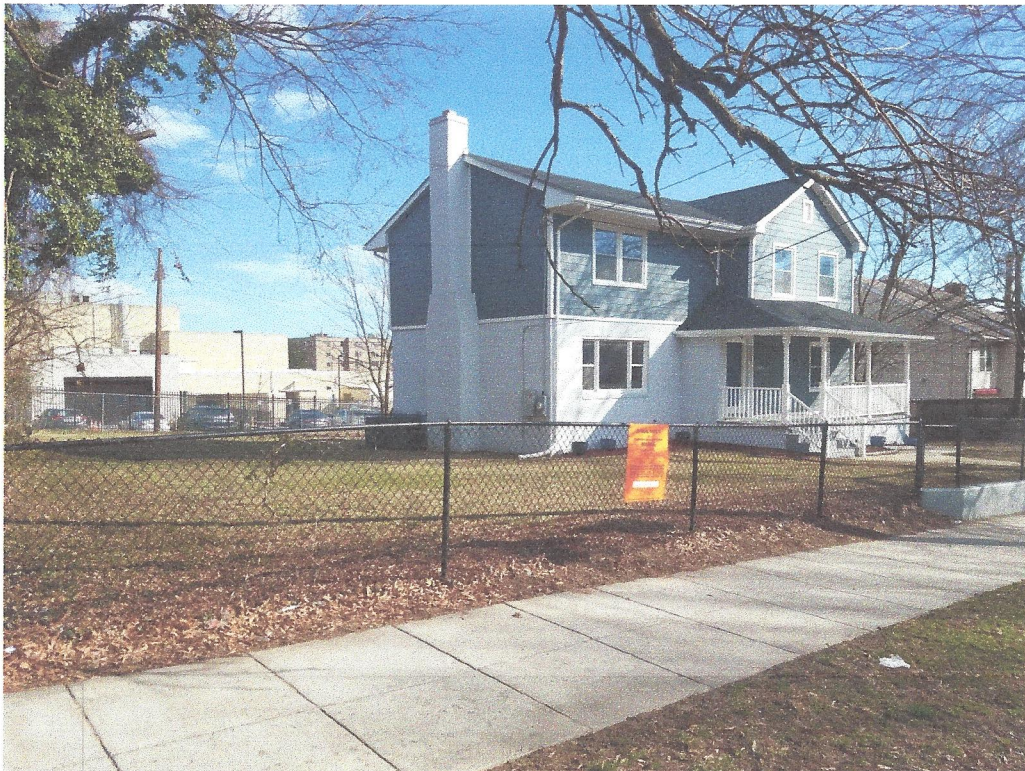
Pic 2 Angle 2 Sign #2