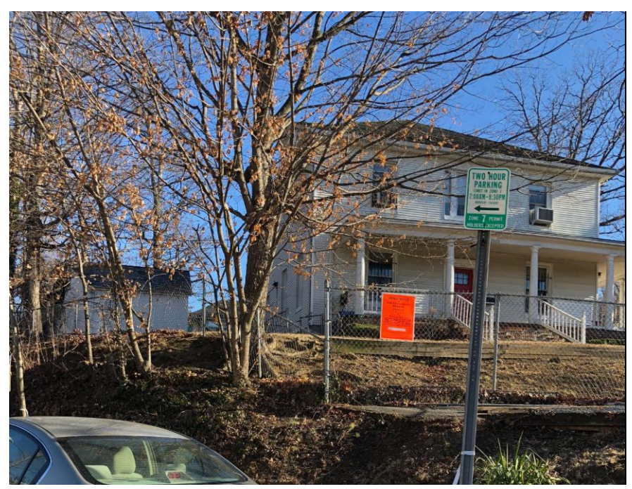
P Street, SE