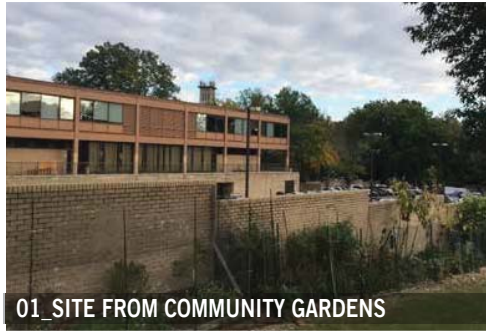
01 SITE FROM COMMUNITY GARDENS