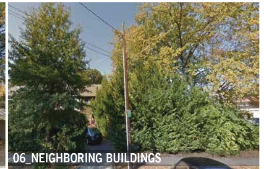
06 NEIGHBORING BUILDINGS