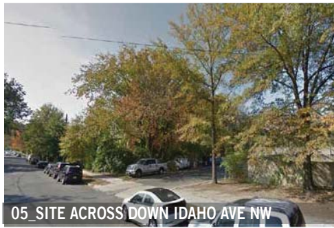
05 SITE ACROSS DOWN IDAHO AVE NW