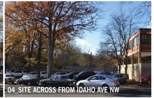
04 SITE ACROSS FROM IDAHO AVE NW