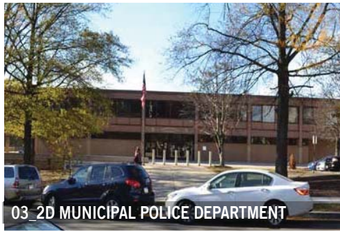
03 2D MUNICIPAL POLICE DEPARTMENT