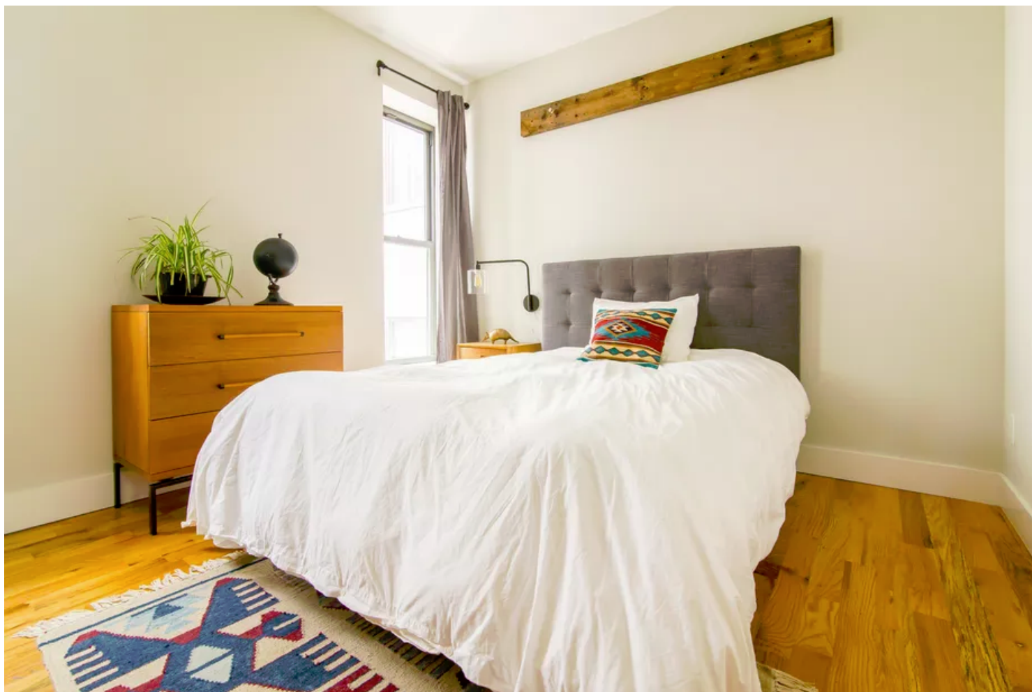
A bedroom in one of Common's Brooklyn locations

This Thursday, co-living company Common released a landing page with new details about their first property in Washington, D.C.