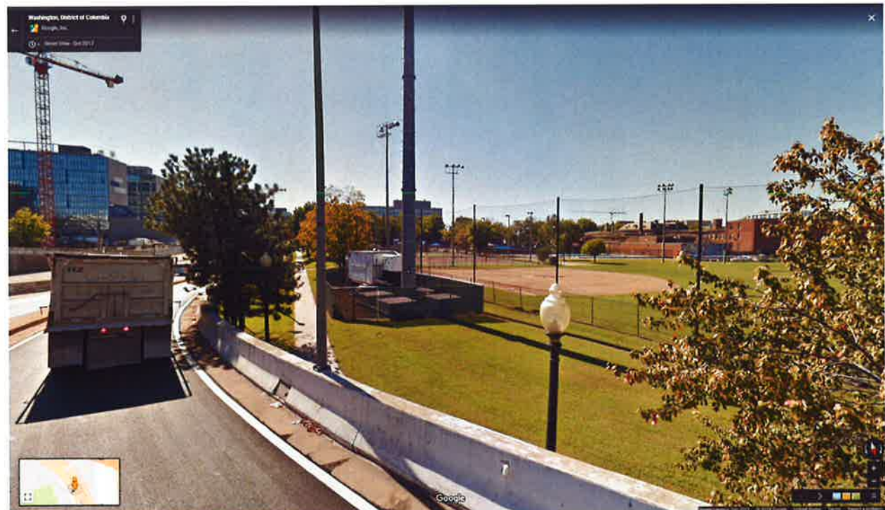
Google Street view image, captured October 2017