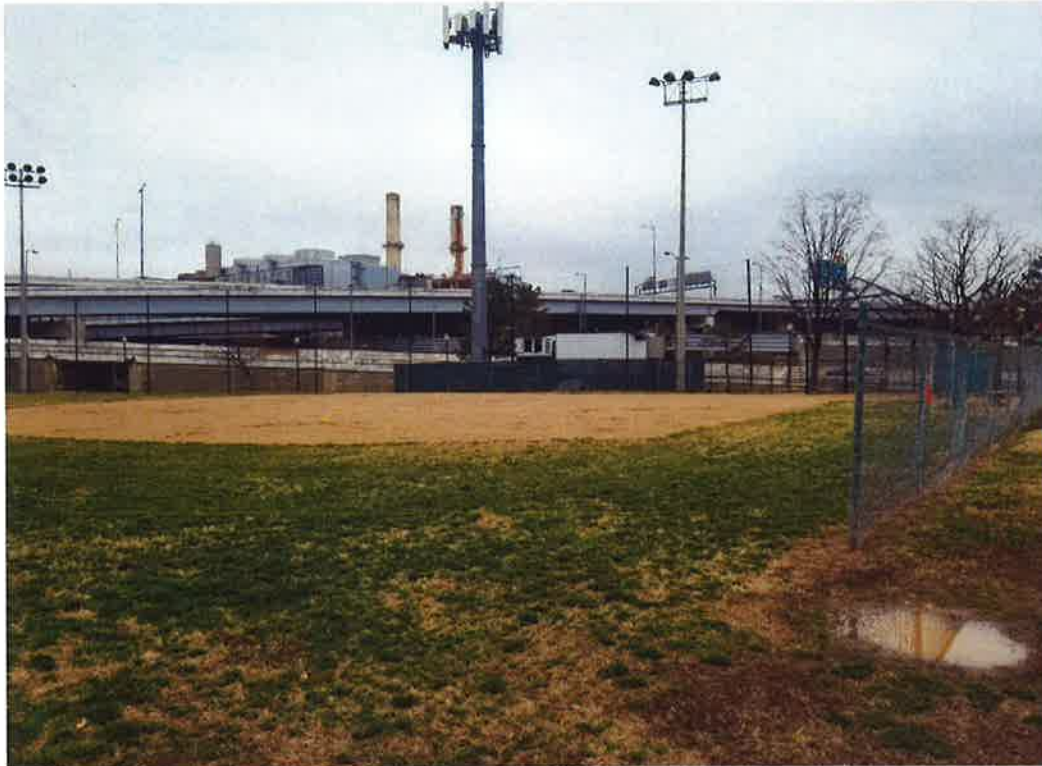
Picture 6 – Looking northeast toward the compound. Photo taken 2/22/2018