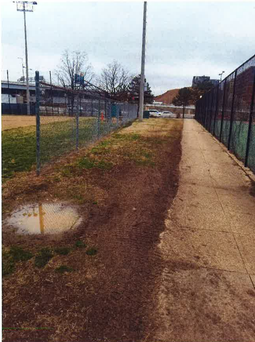
Picture 8 – Showing minor trend damage. Photo taken on 2/2/2018. Area will be restored using sod.