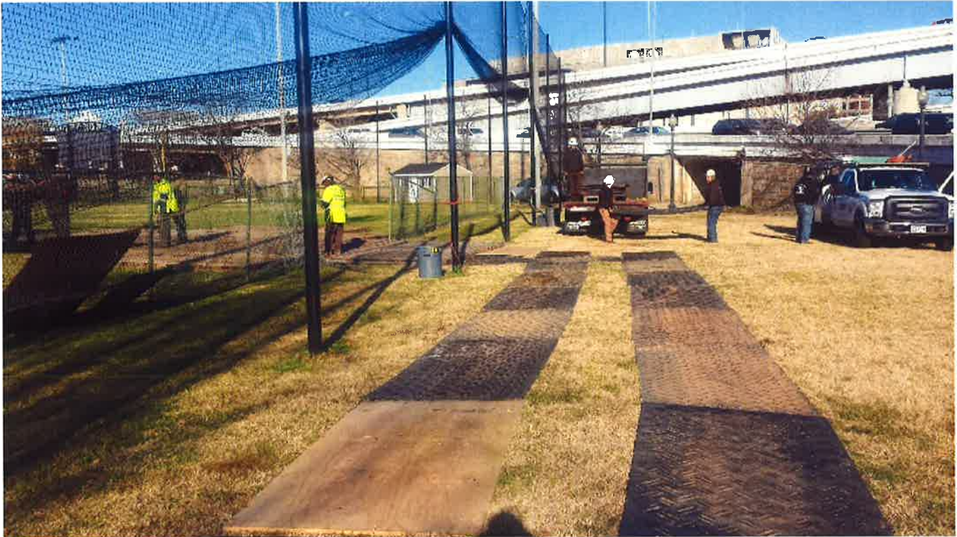
Picture 1: Installation photo showing the opening of the ball field fence and the crane mats.