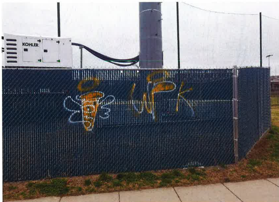
Picture 7: Graffiti on compound fence. Photo taken 2/22/2018. Fence was re-painted on 2/26/18.