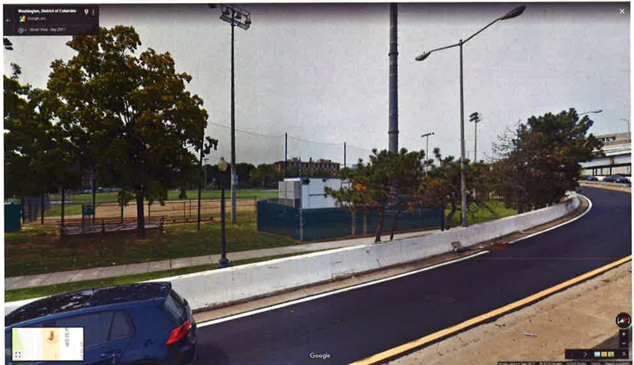
Google Street view image, captured September 2017