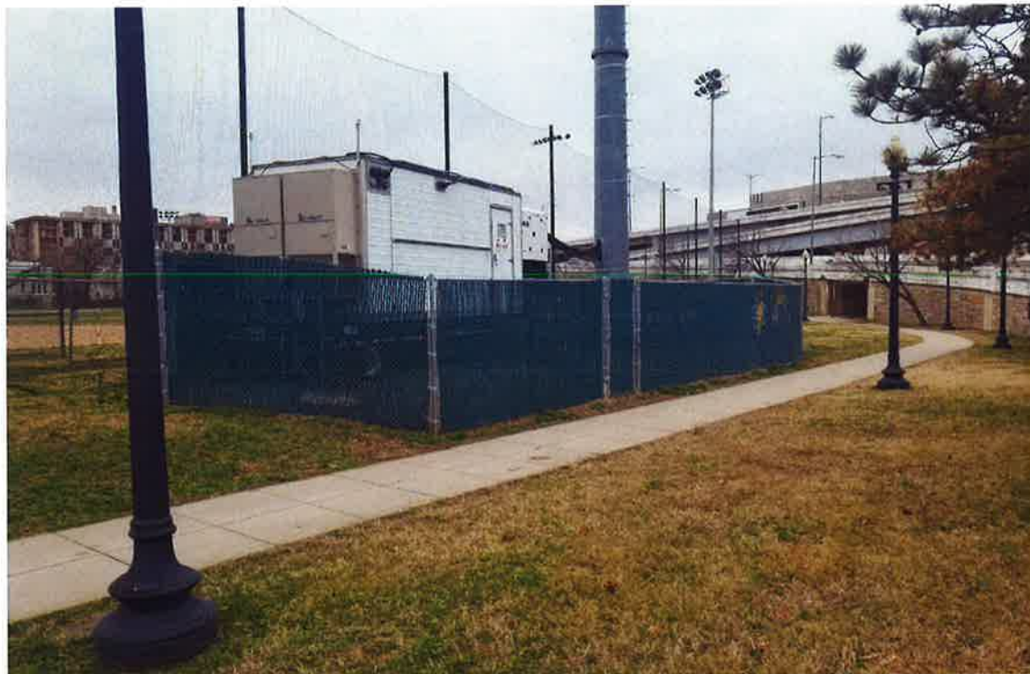
Picture 5 – Looking northwest toward the compound. Photo taken 2/22/2018