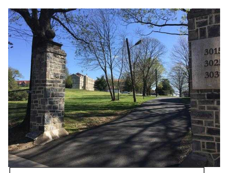
View from Entrance at 4th Street, NE (SE of site)