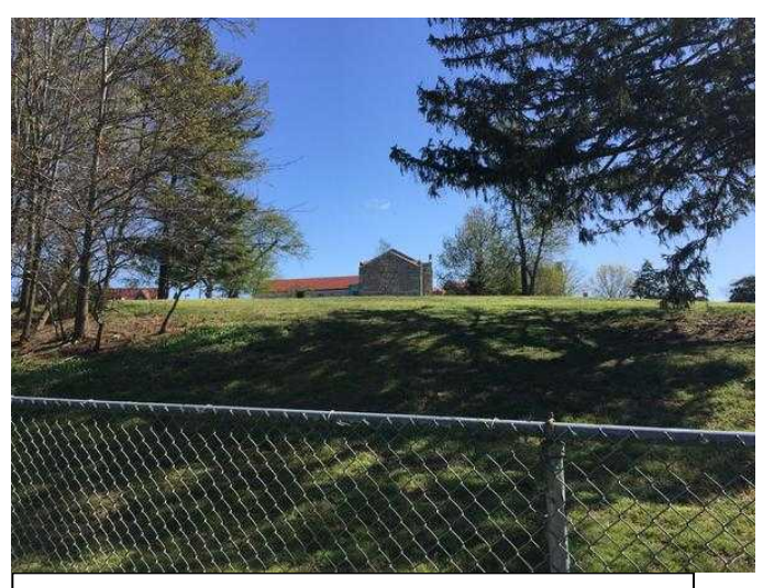
View of site from 4th Street, NE

View north into site from interior private street