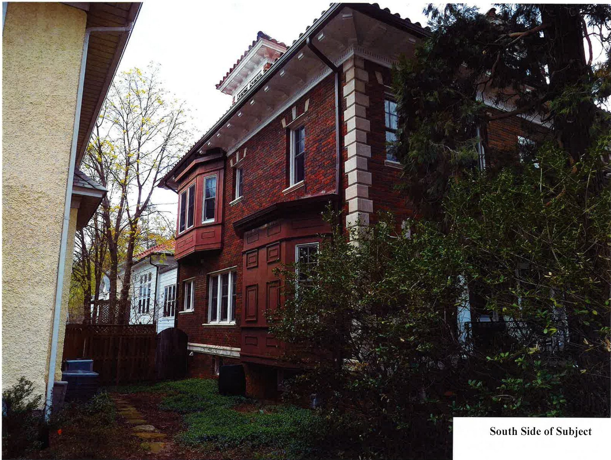
South Side of Subject