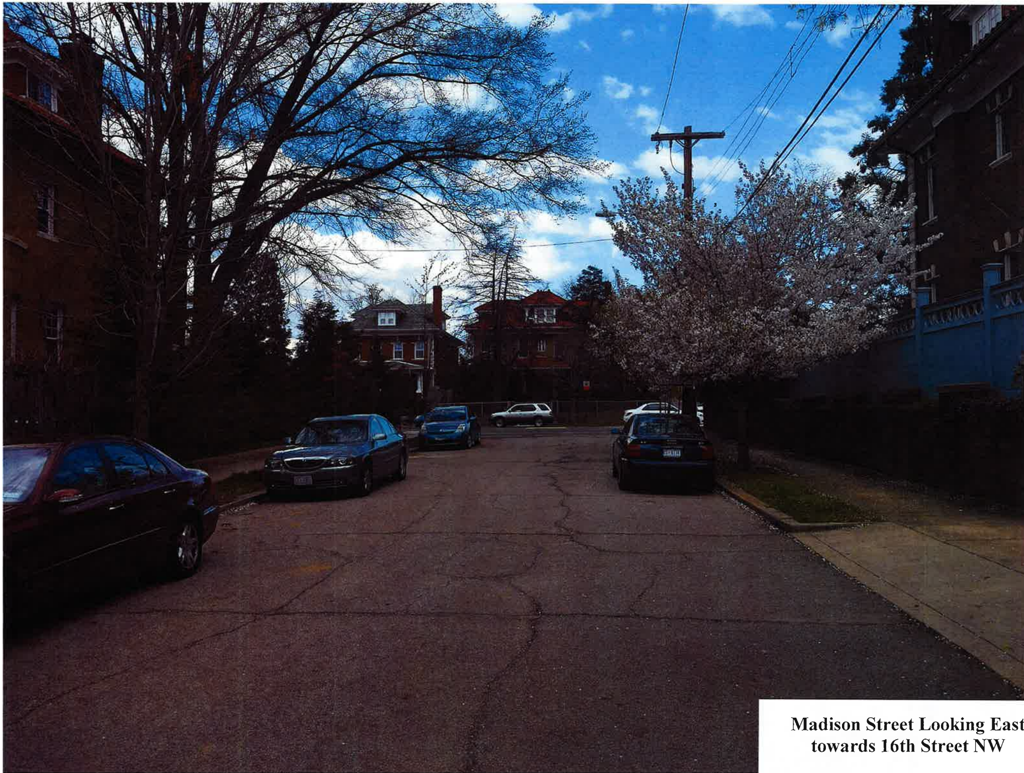
Madison Street Looking East towards 16th Street NW