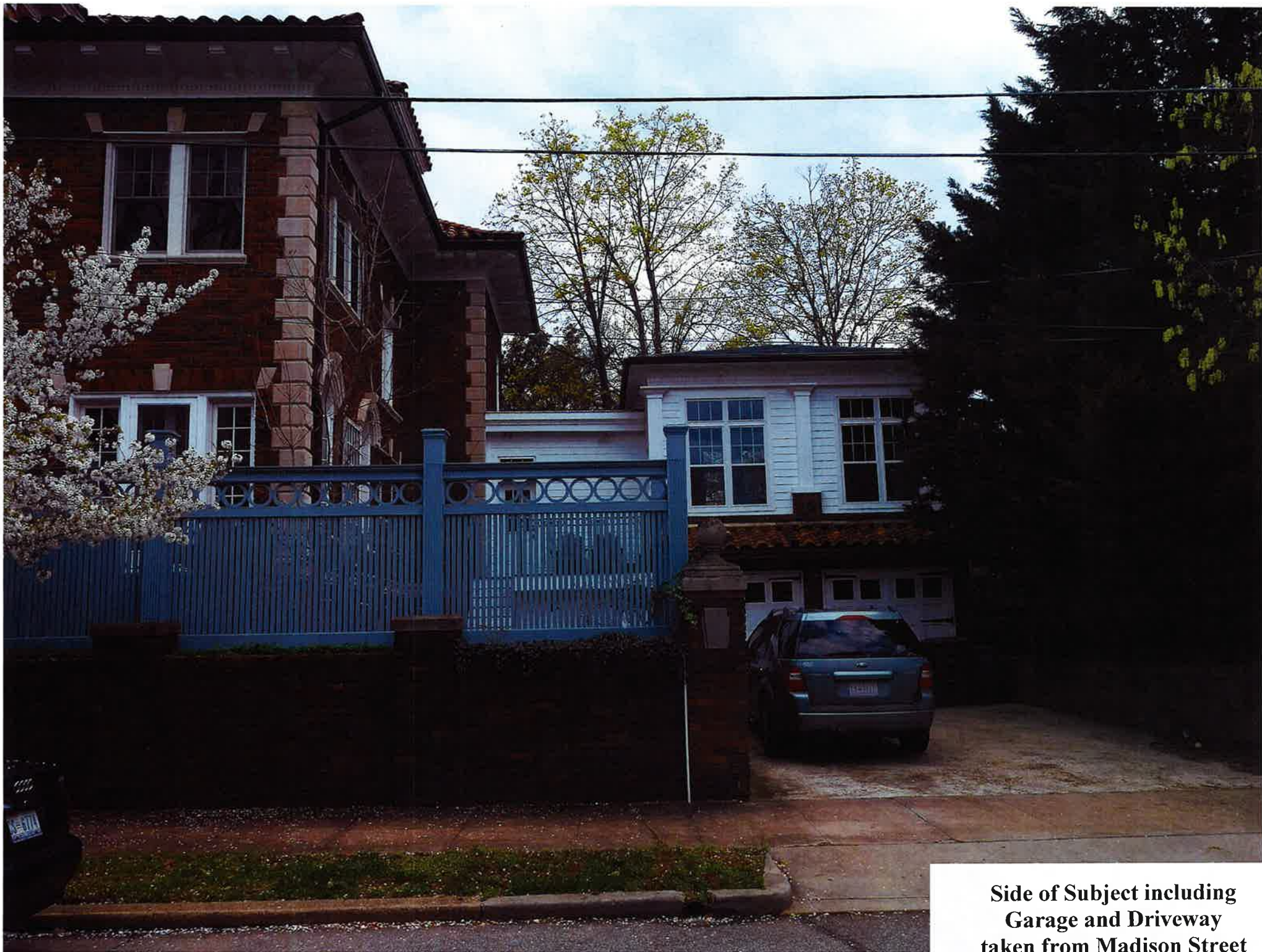
Side of Subject including Garage and Driveway taken from Madison Street